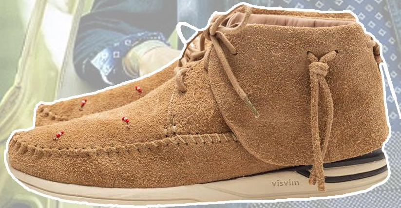
VISVIM LHAMO FOLK (Peggs and Son, 2019)