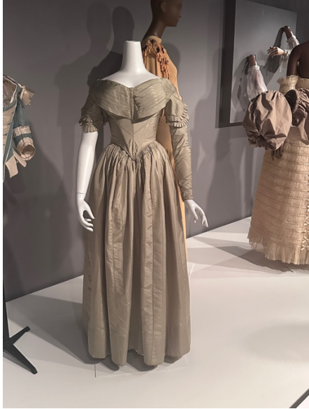
Figure 1. Pale Green Dress.