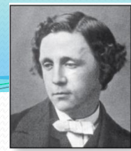
Charles Lutwidge Dodgson (AKA Lewis Carroll) (1832-1898)