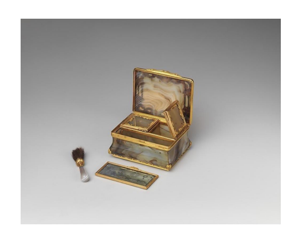
Cosmetics Box for Rouge and Patches, circa 1750-55