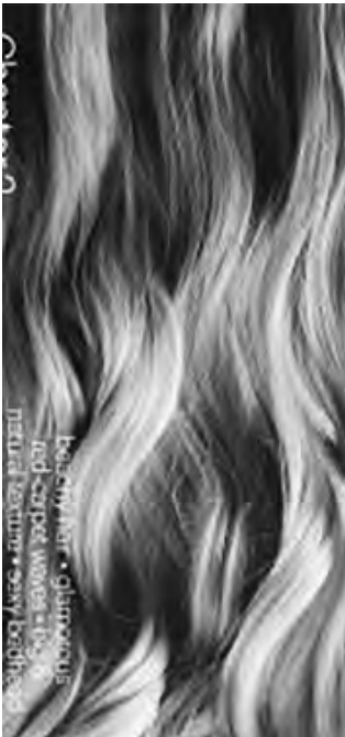
Sample of "Texture" selected image

• Describe the photographs in terms of mood, feeling, texture, pattern, line, surface, shape, rhythm, flow, movement, contrast, light and balance. Keep these descriptions handy, you will need them to achieve your goals.