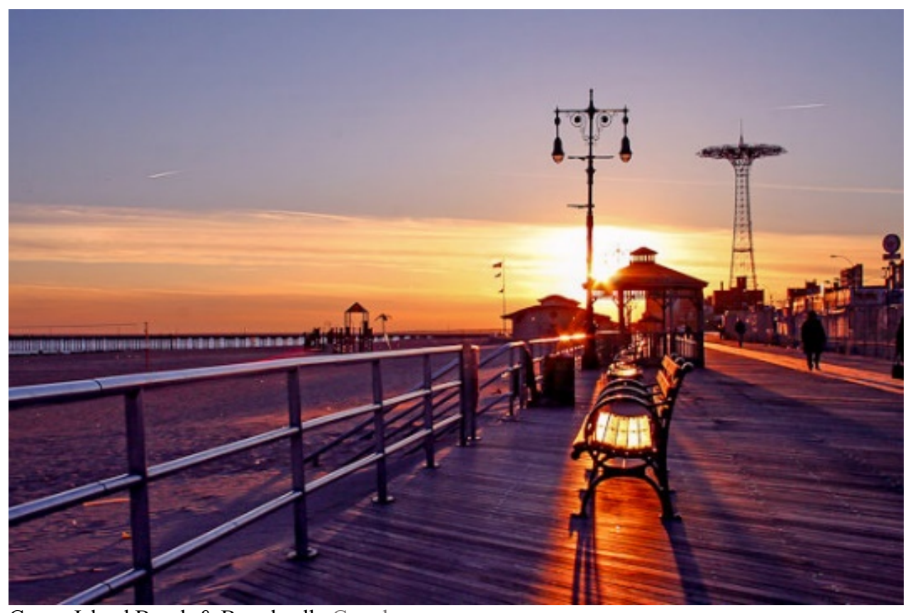
Coney Island Beach & Boardwalk.

At Long Beach Road, go for a lunch break with a delicious meal of hotdog and fries. Everyone knows the Nathan's famous brand hotdog. Every Fourth of July, Nathan's host a hotdog contest. Come pay a visit on the Fourth of July and gather with thousands of other people to witness the competition. Join in the fun atmosphere "to catch a glimpse of these hot dog eating legends and the celebration that is as uniquely American as it is Nathan's." (http://www.nathansfamous.com/)