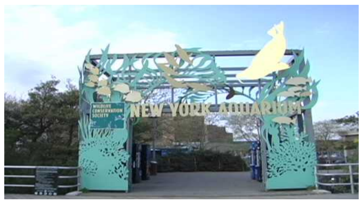
New York Aquarium. Google