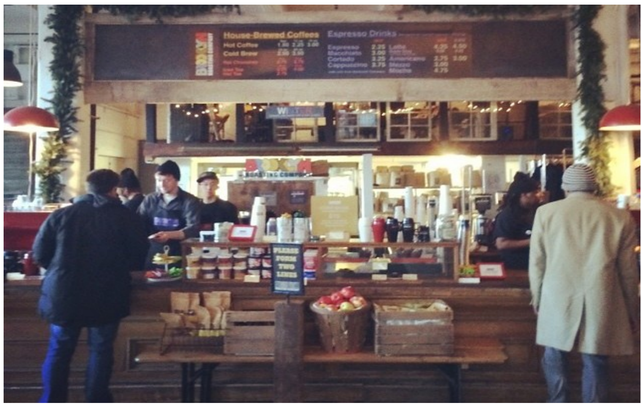
Brooklyn Roasting Company. http://www.brooklynroasting.com/