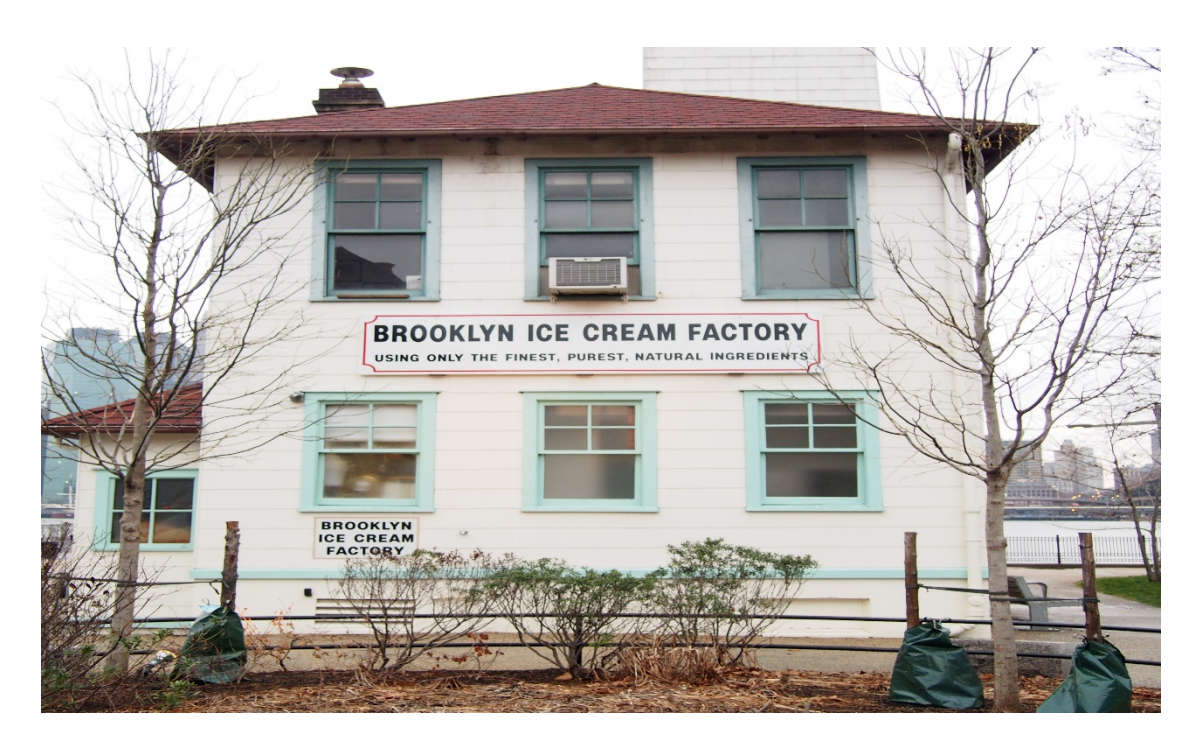
Brooklyn Ice Cream Factory.