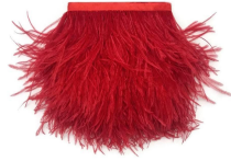
Red Ostrich feather