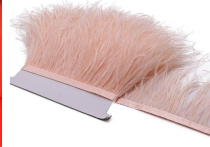
Baby pink ostrich feather