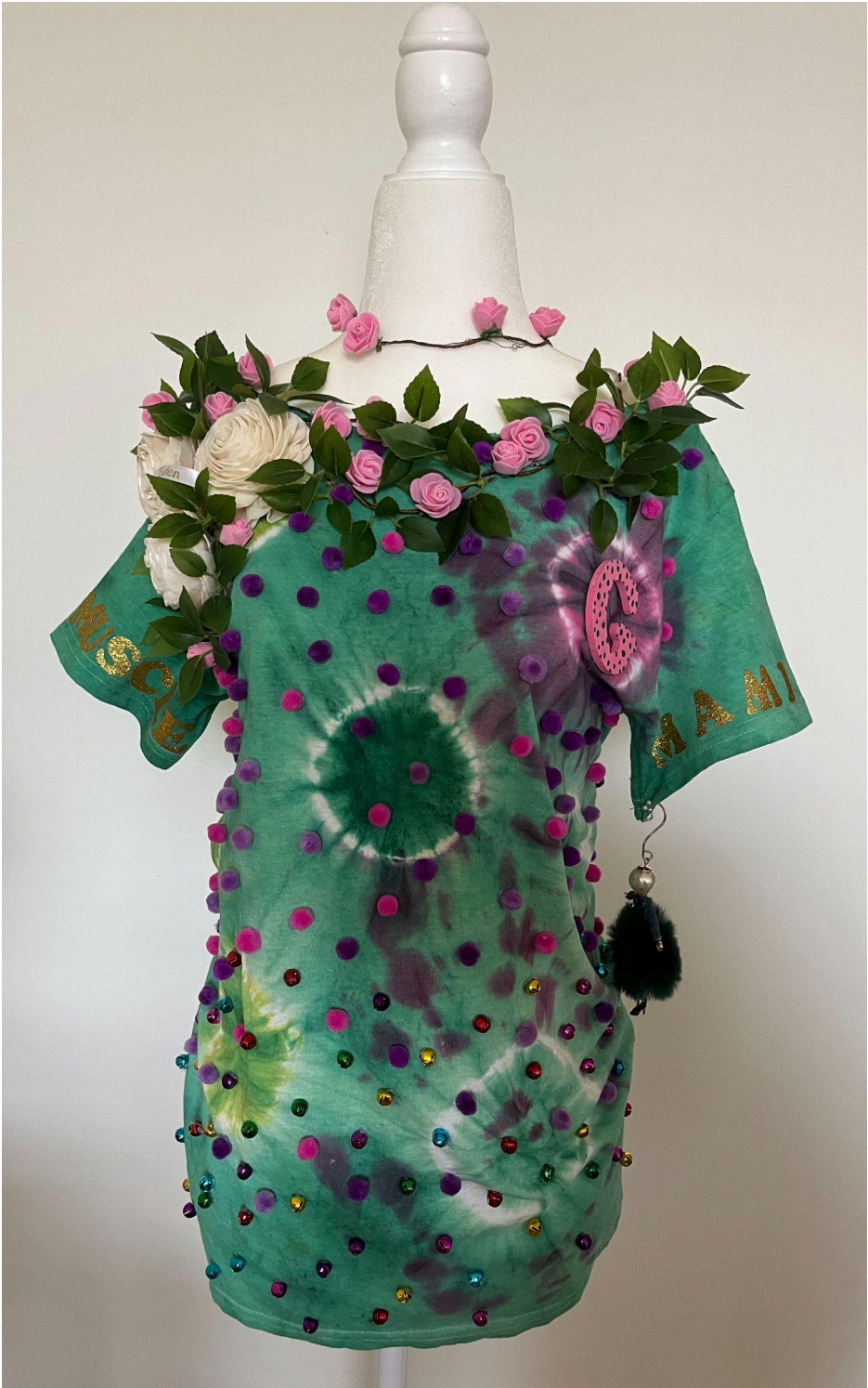
Figure 1, Mujer, Madre, Latina T-Shirt