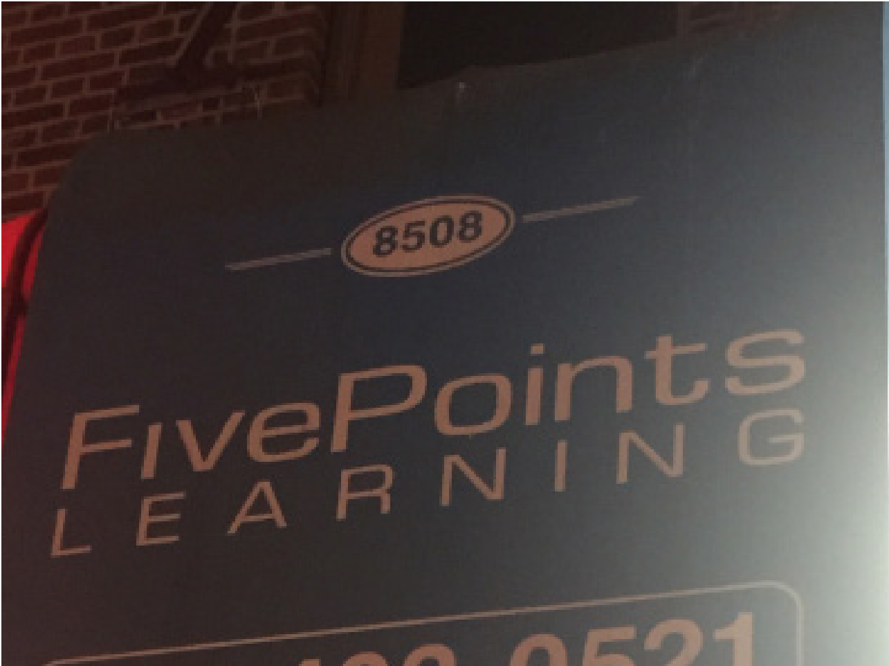
Too much space between words