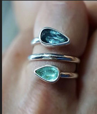
Double Tourmaline Ring