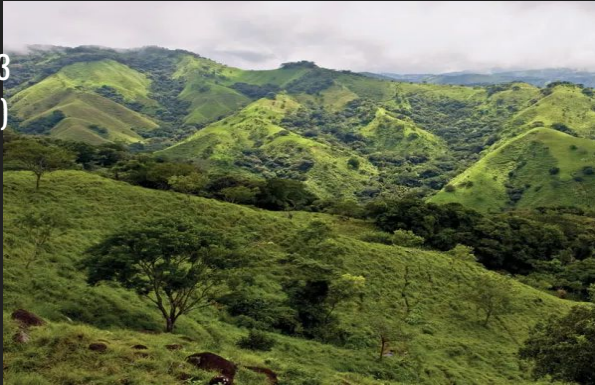
Overview of Costa Rica's Land