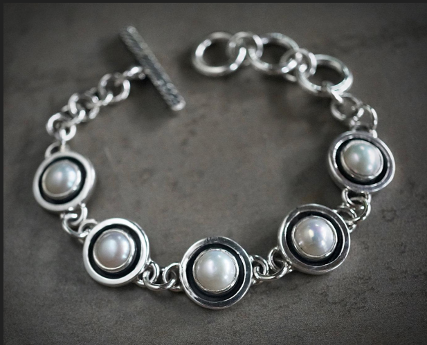
Freshwater pearl set in handmade 950 solid silver, oxidized. (Figure 18)