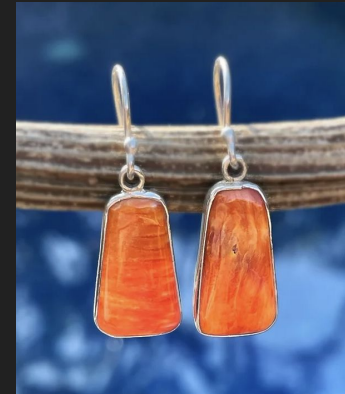
Spiny Oyster Seashell Earrings

Figure 1, 2, 3: Ek Art Jewelry Store . Ek Art Jewelry. (2022). Retrieved Aug 8, 2022, from https://www.ekartjewelrystore.com/