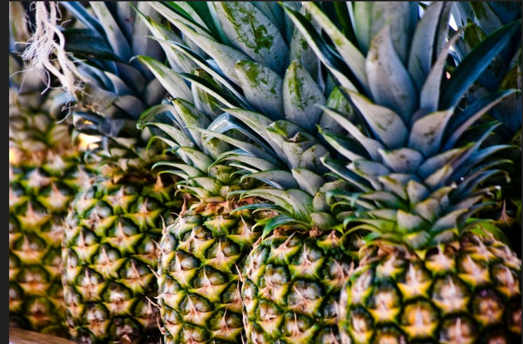
Costa Rica pineapple farms Rozak, 2017

Figure 14: Rozak, R. (2017, March 18). Costa Rica's pineapple industry: Sweet or sour? Panoramas. Retrieved August 8, 2022, from https://www.panoramas.pitt.edu/health-and-society/costa-ricas-pineapple-industry-sweet-or-sour