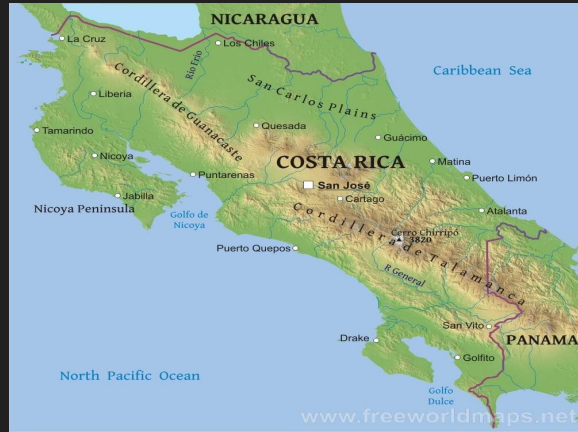
Costa Rica Map