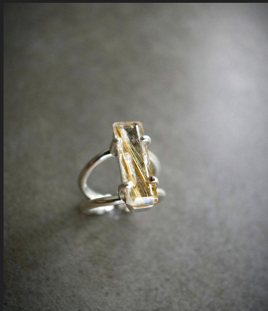
Rutilated Quartz set in solid 950 silver, open back. (Figure 19)