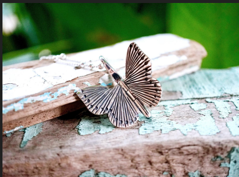
Hammered butterfly necklace, oxidized, 950 solid silver. (Figure 21)