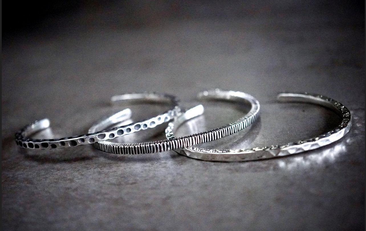
Textured Cuffs, 950 solid cuff, hammered and oxidized. (Figure 22)