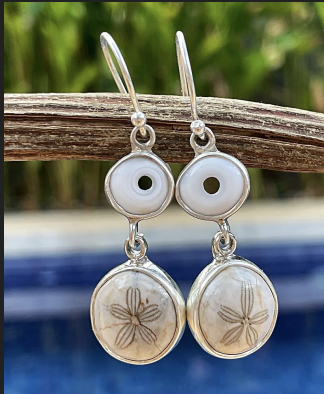
Sandollar fossil and Puka Seashell Earrings