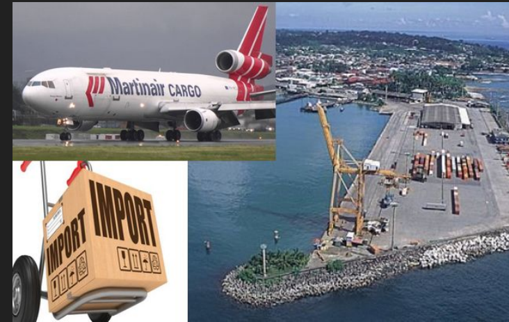
Import and export station Costa Rica Law, 2016