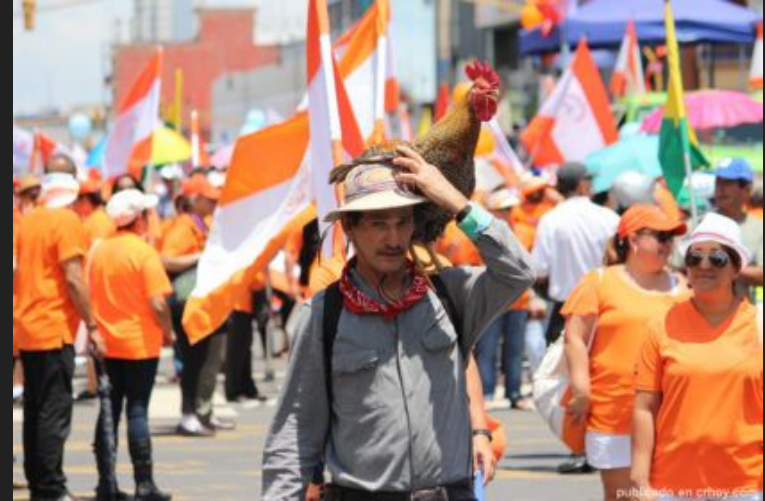
Costa Rican workers on Labor Day American Expatriate Costa Rica, 2017

Figure 15 : American Expatriate Costa Rica. (2017, May 2). Costa Rican workers on Labor Day . American Expatriate Costa Rica. Retrieved August 8, 2022, from https://www.usexpatcostarica.com/costa-rican-workers-on-labor-day/