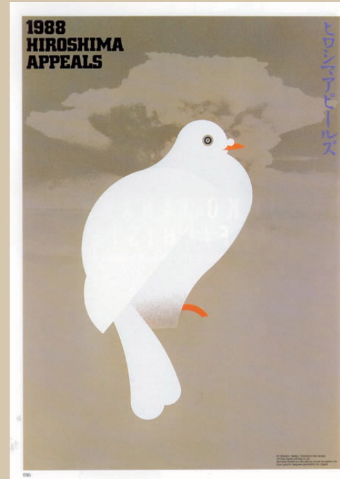
1988 Hiroshima Appeals