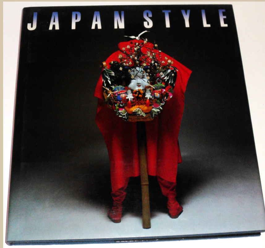
"Japan Style" by Ikko Tanaka