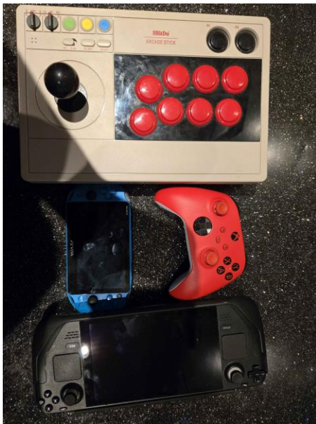
Controller of all kinds

photo give a sense of balance in a way. I was always curious about computers and anything tech-related. My dad is an electrician and always taught me a couple of things whenever he had the chance. He even took me to some of his safer jobs to give me more hands-on teaching. In a way, he inspired me to learn and take on technical hardware. With each mistake I made, I would take the time to understand and learn what I did wrong. I even had one of the devices I worked with nearly short-circuit due to the solder touching two points on the motherboard. It's also the reason for my choice of major and the reason why I'm still studying.