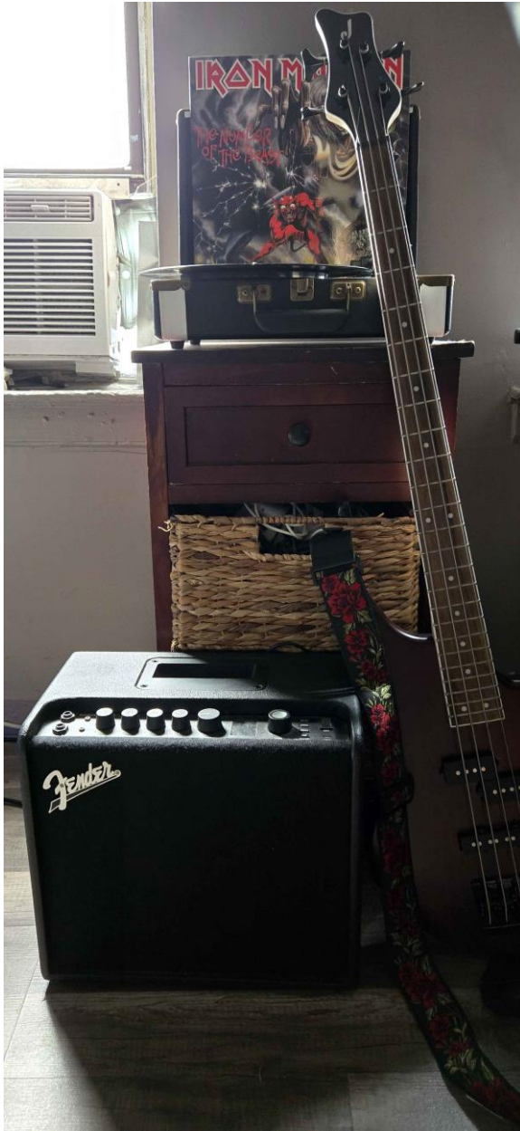
Music for the Stress

The photo, “Music for the Stressed” shows every music-related item I own. The vinyl player was a gift from my cousins an Iron Maiden vinyl of their album “The Number of The Beast”. The Bass guitar is a Jackson JS Series spectrum with a mix combination of a jazz and precision style bass and a heavy walnut dark brown body. I wanted to give a narrative on my music taste, style, and personality from this one photo. I have recently picked up