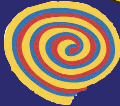
"El sol de Colombia por el mundo."

- Winner of a design contest hosted by Colombia's National Tourism Corporation in 1991.