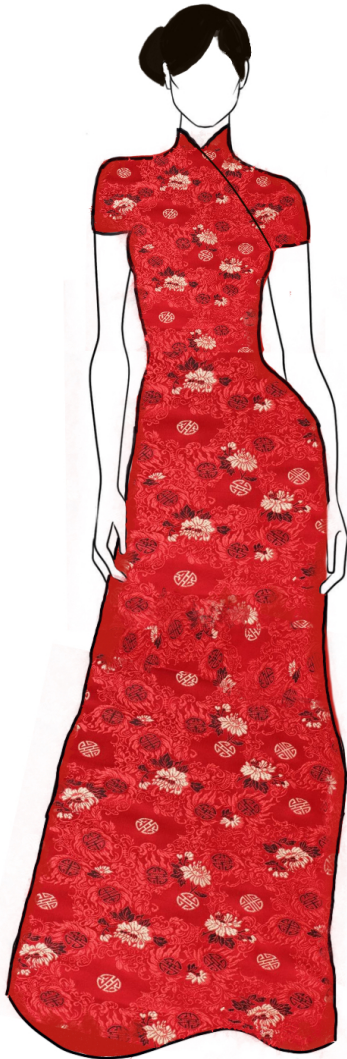
QIPAO SILK DRESS