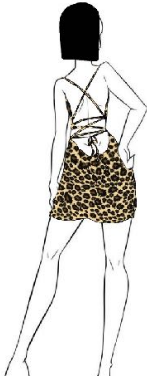
2021/2022 COWL NECK SILK SLIP DRESS