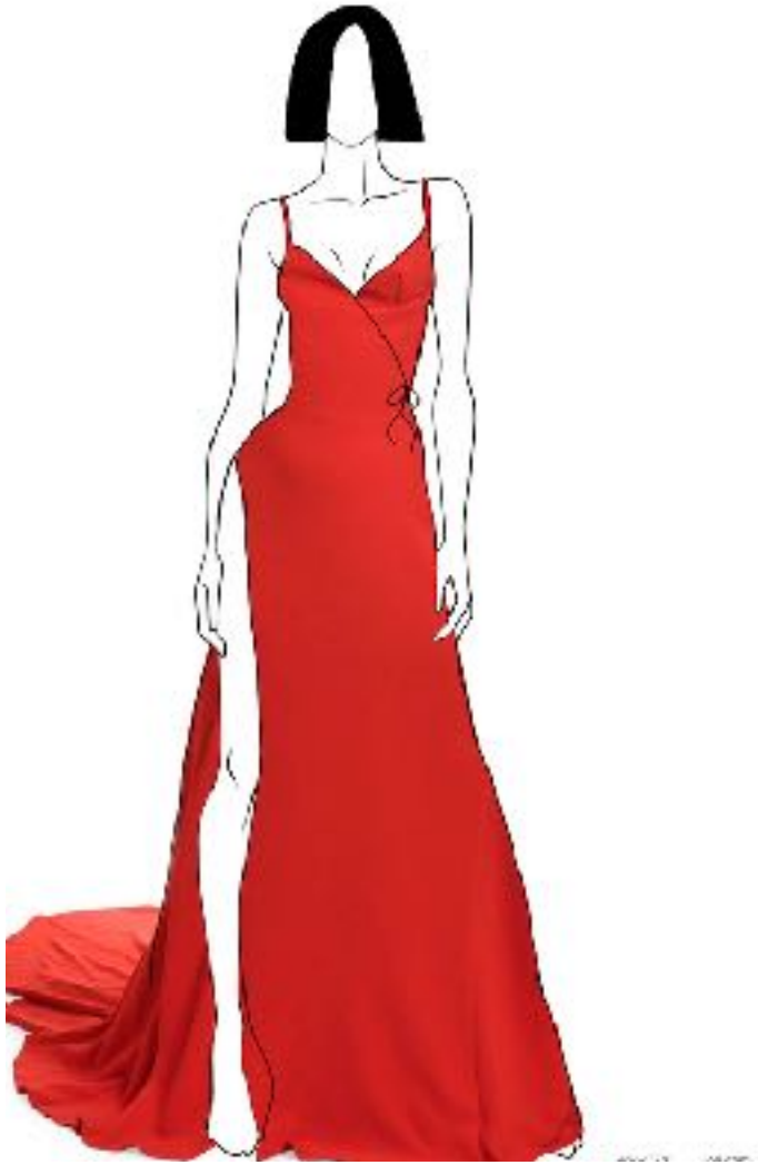
THIGH HIGH SLIT SILK DRESS