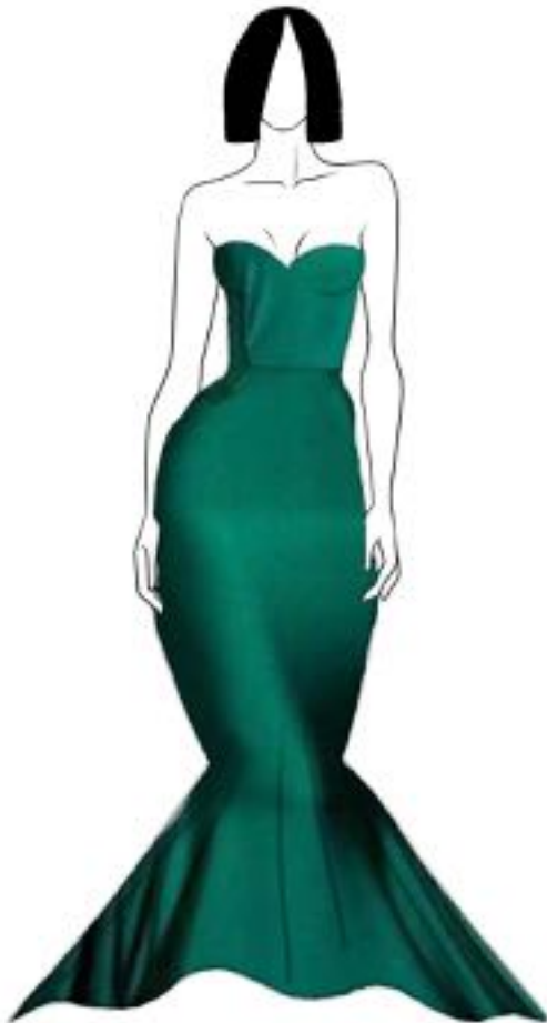
MERMAID SILK DRESS