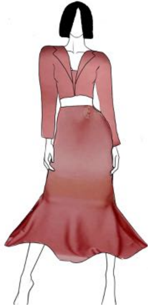
2021/2022 MERMAID SILK TWO-PIECE SUIT