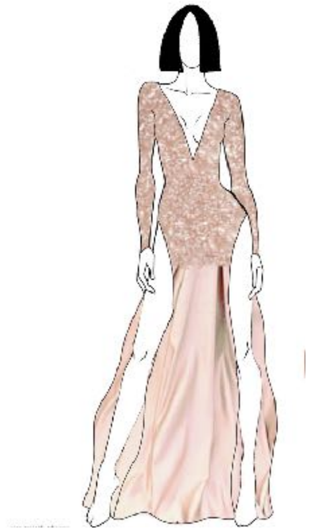
2021/2022 THIGH HIGH SLIT SILK DRESS