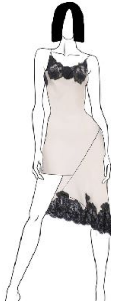
2021/2022 LACE TRIM SILK DRESS