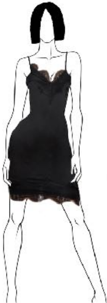
LACE TRIM SILK DRESS