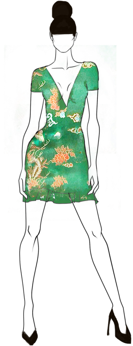
2021/2022 QIPAO SILK DRESS