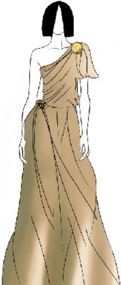
GRECIAN STYLE SILK DRESS