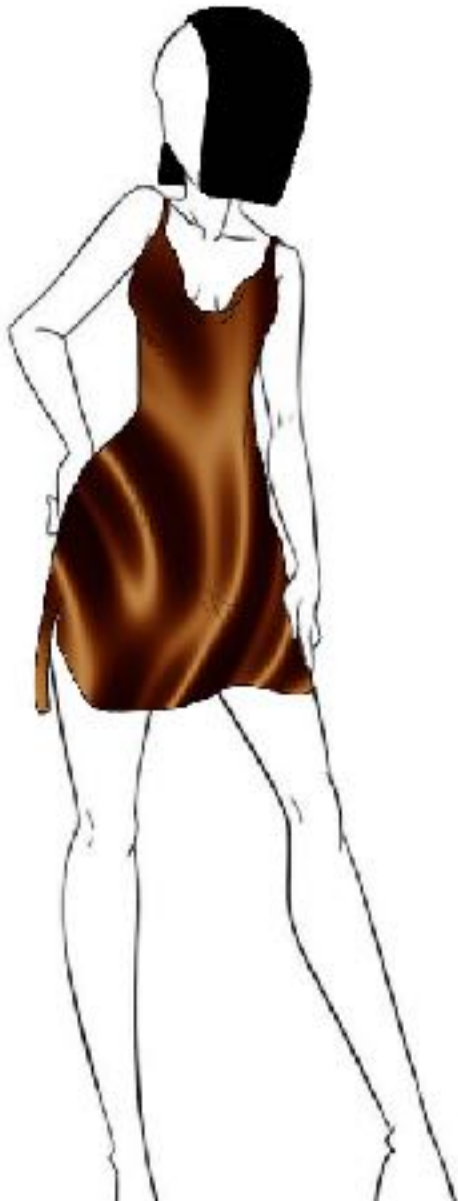
COWL NECK SILK SLIP DRESS