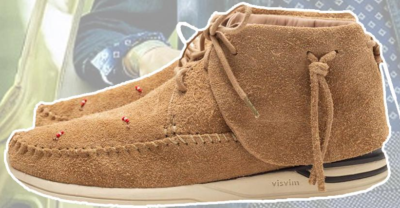
VISVIM LHAMO FOLK (Peggs and Son, 2019)