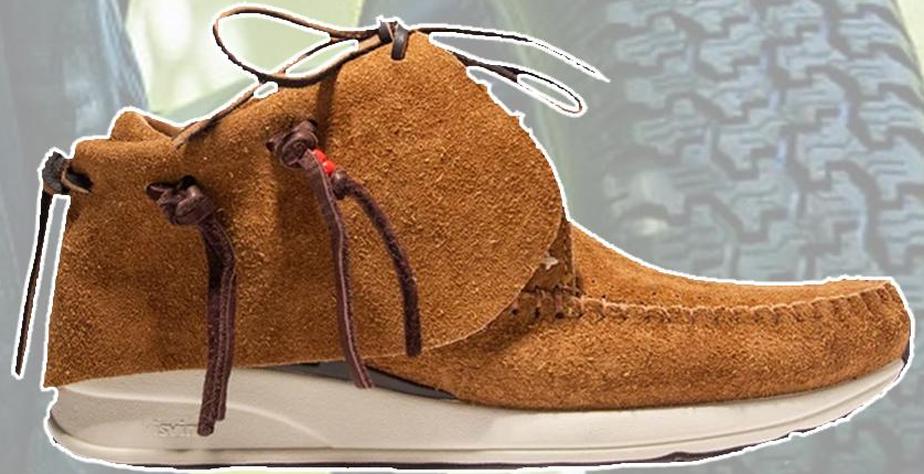
VISVIM FBT (Union Los Angeles, 2019)