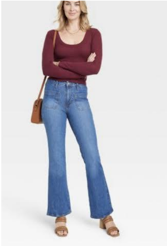
Image taken from Target , Women's Long Sleeve Ribbed Scoop Neck T-Shirt - Universal Thread™ https://www.target.com/p/women-s-long-sleeve-ribbed-scoop-neck-t-shirt-universal-thread/-/A-88441036?preselect=88283296#Ink=sametab

The back of the top is simple with a small upside down V-cut design down the mid-back. The scoop neck only runs along the front of the shirt, allowing the back to have full coverage. I went onto the Target website and found they paired it with bell bottom jeans, another fashion-forward item for the season, along with a taupe bag and taupe chunky sandals. Personally, I would've styled this very similar to the way Target did.