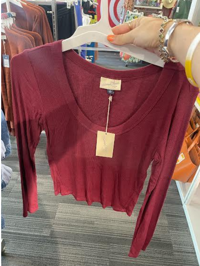
Image taken at Target : 6401 18 Ave. Brooklyn, NY 11204 September 10, 2023

The top I chose is this wine colored red long sleeve ribbed scoop neck t-shirt, found in Target. The reason I chose this top was the purpose of its color, along with it being a semi crop top. This top would be perfect for an everyday-wear essential to have in your closet during the fall season. The scoop neck is perfect to allow room in the chest area. The material of this top has a very soft, elegant feeling on the skin. The materials used to create this top are 96% rayon giving its very soft texture, along with 4% spandex, allowing a slight stretch in the shirt.