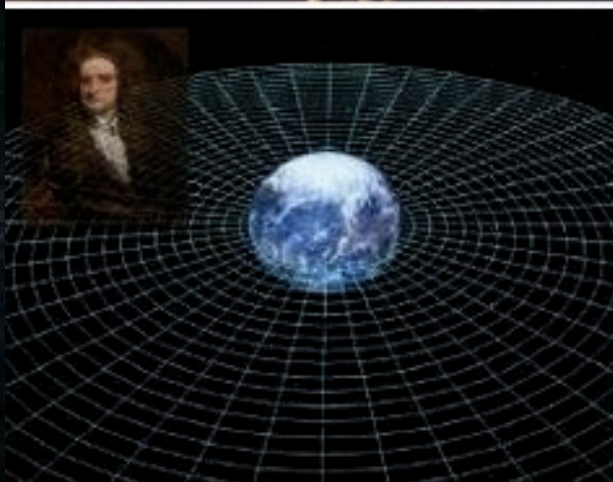
Newton's fixed space