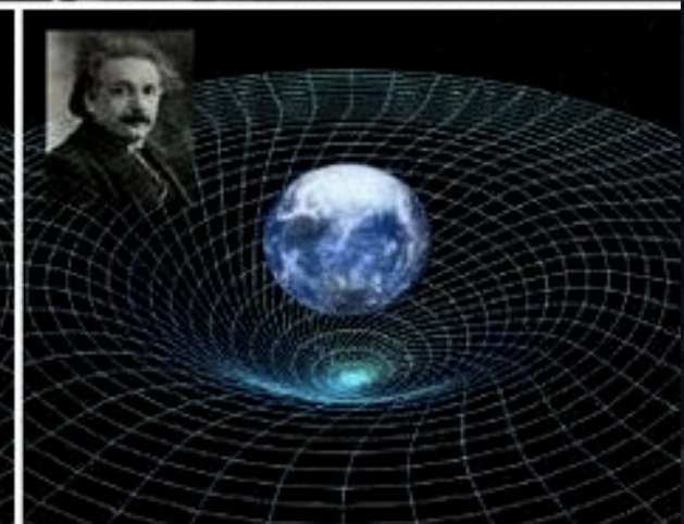
Einstein's flexible space-time