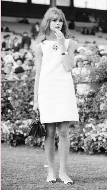
1965 Colin Rolfe's "White Shift Dress"