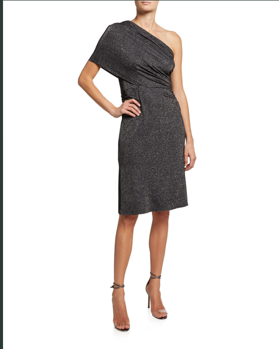
Title Harmon Metallic One-Shoulder Dress Date: 2020 Materials: Polyester URL: https://www.neimanmarcus.com/p/halston-harmon-metallic-one-shoulder-dress-prod238210258