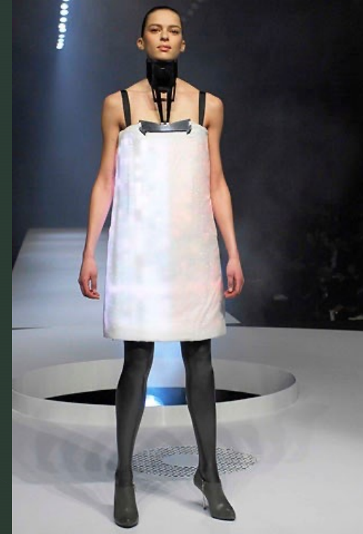
Title: LED Dress Date: Fall 2007 Materials: canvas URL: https://www.vogue.com/fashion-shows/fall-2007-ready-to-wear/chalayan