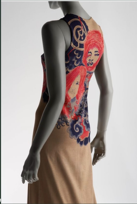
Title: Dress "Tattoo" Date: Autumn / Winter 1971 Materials: Cotton URL: https://artsandculture.google.com/asset/dress-tattoo/FgGSEiMiPN3DYw