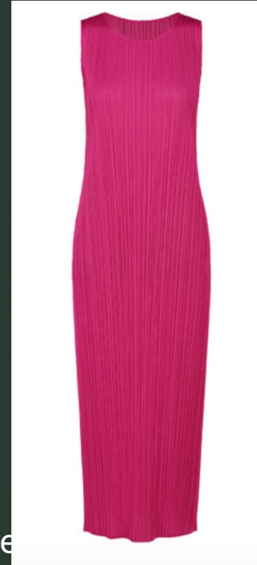
Title: sleeveless dress Date: 2020 Materials: polyester URL: https://store.isseymiyake.com/fs/isseymiyake/pl_all_all/PP11JH127