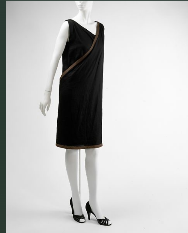
Title: Dress Date: spring/summer 1983 Materials: (a) linen; (b) leather, metal URL:

http://luxurycollectors.info/versace_mens_22/