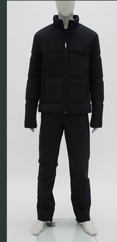
Title: Ensemble Date: fall/winter 2009–10 Materials: wool, synthetic, silk, cotton, metal URL: https://www.metmuseum.org/art/collection/search/15488 4