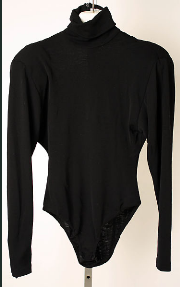
Title: Ensemble Date: 1985 Materials: wool URL: https://www.metmuseum.org/art/collection/search/81027