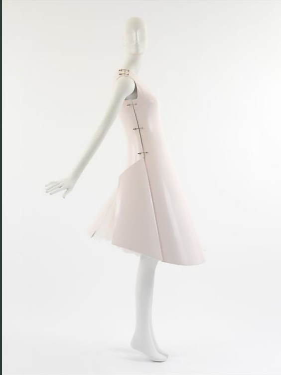
Title: "Remote Control" Date: spring/summer 2000, edition 2005 Materials: a,c) fiberglass, metal; b) cotton, synthetic URL: https://www.metmuseum.org/art/collection/search/124594