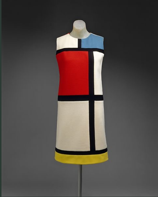
Title: Dress Date: fall/winter 1965–66 Materials: wool URL: https://www.metmuseum.org/art/collection/search/834 42