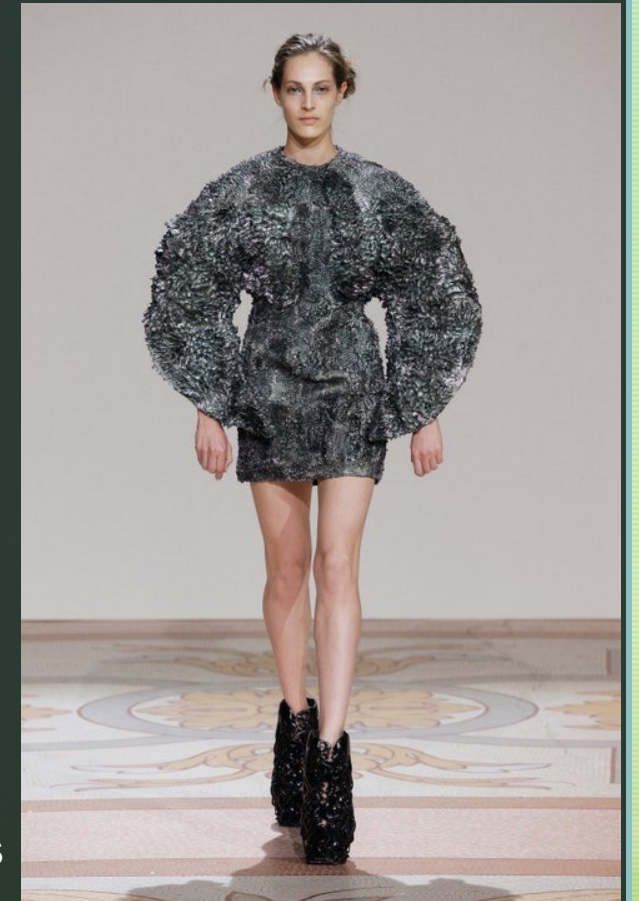
Title: Moon Dress

URL: https://www.cincinnatiartmuseum.org/about/blog/iris-top-5/