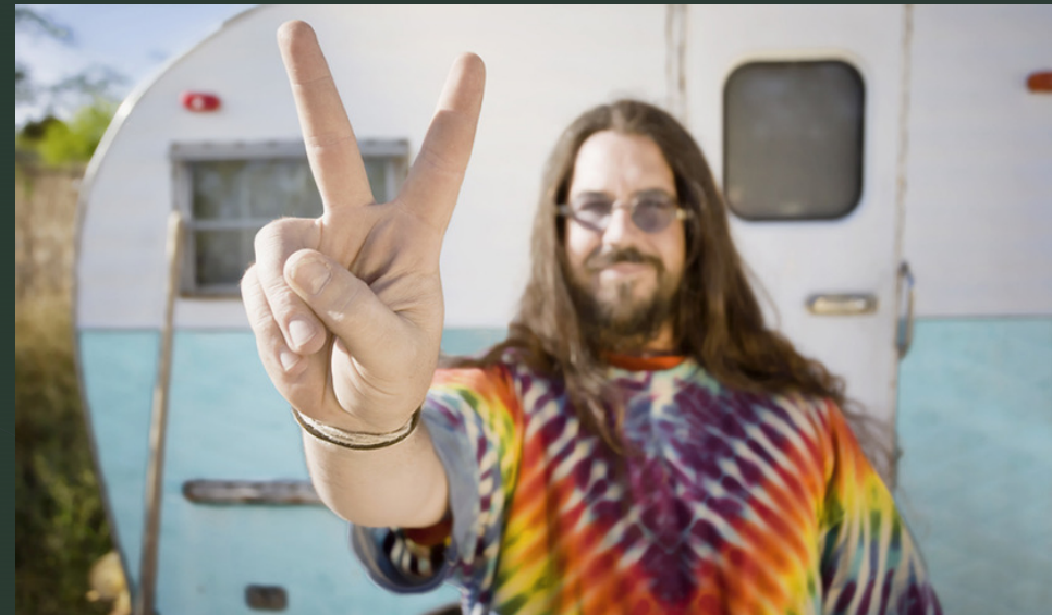
Title: Tie Dye T-shirt

URL: https://vintagedancer.com/1960s/hippies-in-the-60s-fashion-festivals-flower-power/