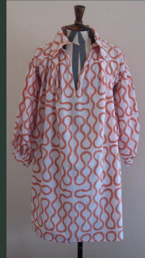
Title: "Pirate" Date: 1981 Materials: cotton URL: https://www.metmuseum.org/art/collection/search/129650