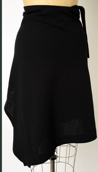
Title: Skirt Date: 1987 Materials: wool URL: https://www.metmuseum.org/art/collection/search/81200