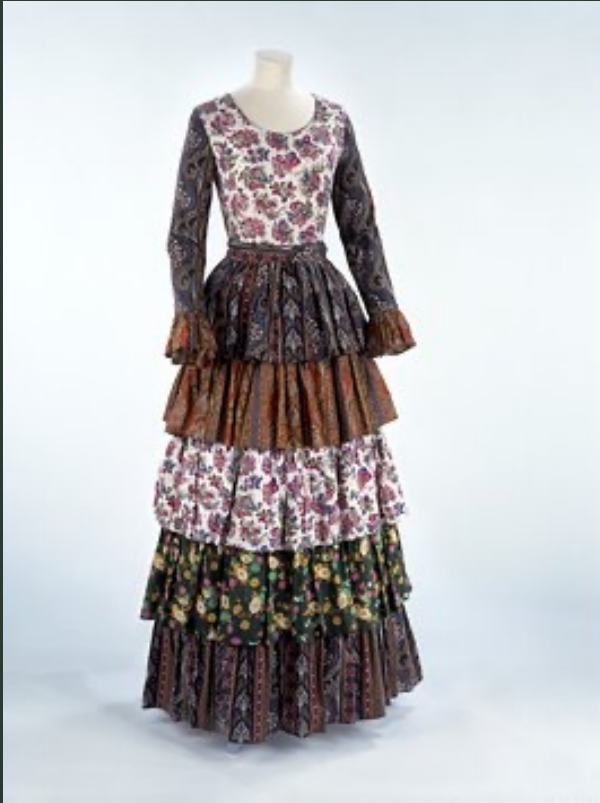
Title: Dress Date: 1970-71 Materials: Cotton, crepe, machine sewn URL: http://collections.vam.ac.uk/item/O48522/dress-wedge-james/