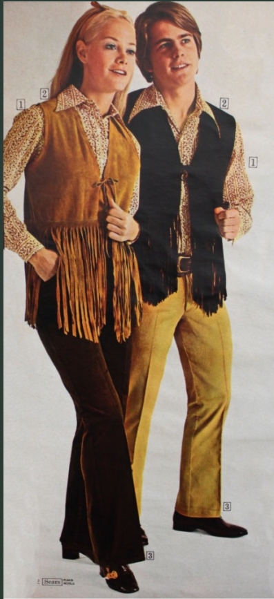
Title: Fringe Vest