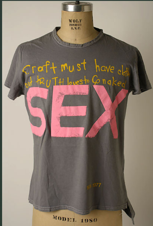
Title: "SEX Craft must have clothes" Date: 1999–2000 Materials: cotton URL: https://www.metmuseum.org/art/collection/search/129628