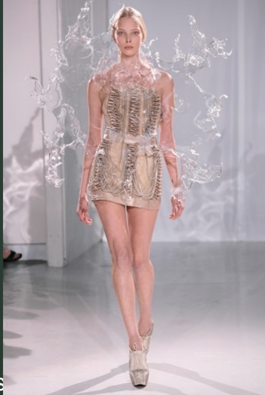
Title: Crystallization Dress