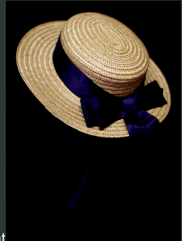
Title: Straw Boater Hat Date: 1980s Materials: straw/grass with satin ribbon URL: https://www.alexandra-king.com/products/vintage-1980s-laura-ashley-straw-boater-hat