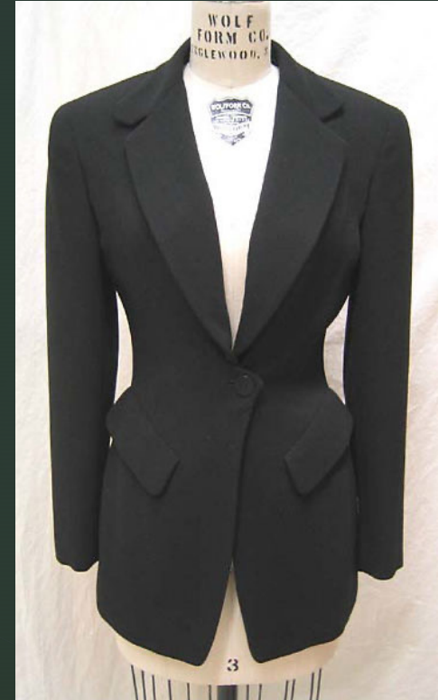
Title: Suit Date: 1990s Materials: wool URL: https://www.metmuseum.org/art/collection/search/80965