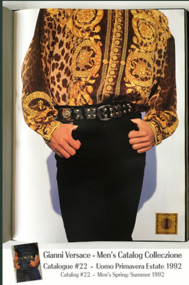
Title: Shirt Date: 1992 Materials: silk URL:

http://luxurycollectors.info/versace_mens_22/