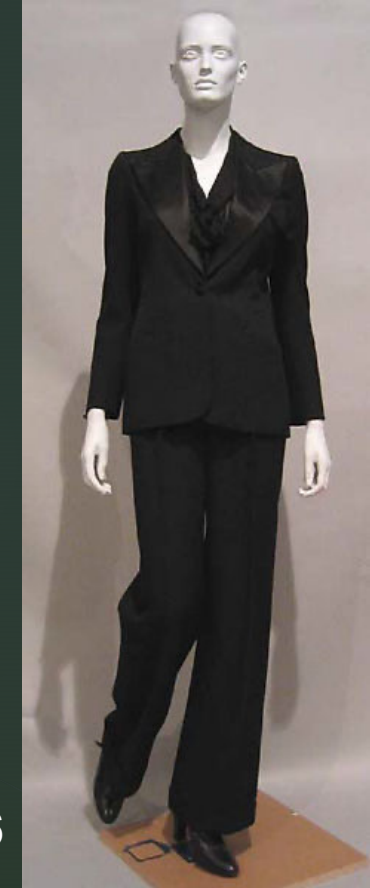
Title: Smoking Date: spring/summer 1976 Materials: (a, d, f) wool (b, c, e) silk URL: https://www.metmuseum.org/art/collection/search/97201