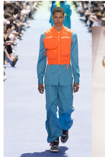
Louis Vuitton SS19