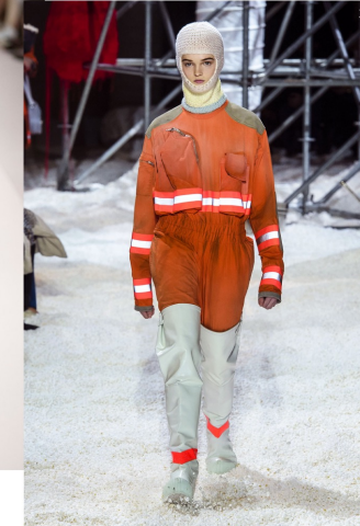
Calvin Klein FW18