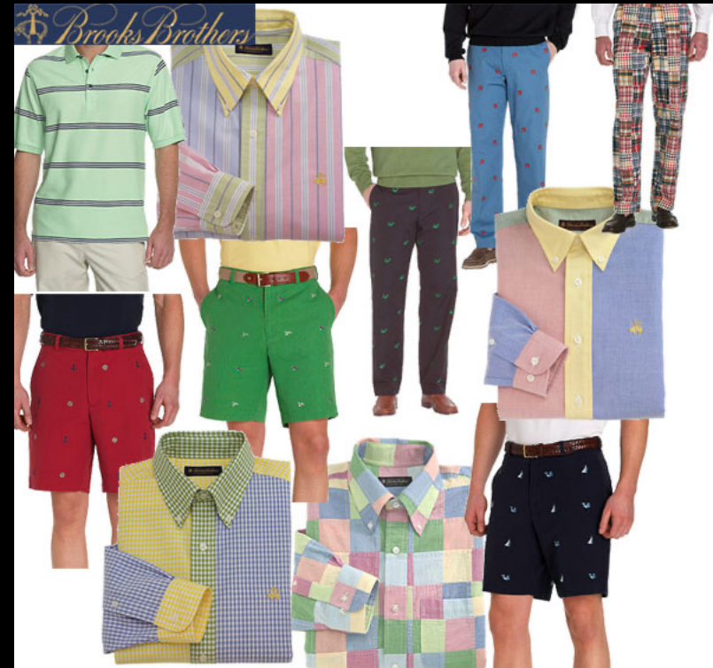
Brook Brothers Bermuda shorts and weird trousers.