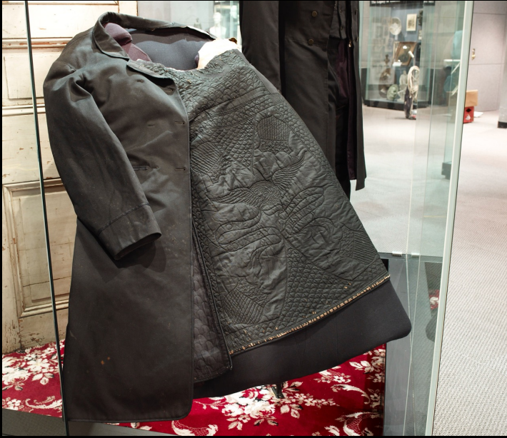
Abraham Lincoln's frock coat by Brooks Brothers