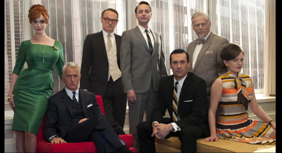
Cast of Mad Men wearing Brooks Brothers