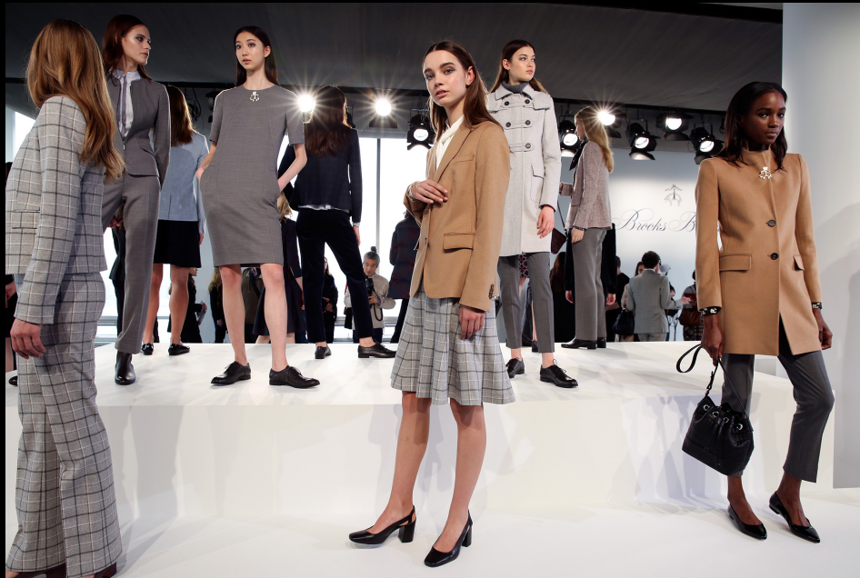
Brook Brothers RTW Fall 17