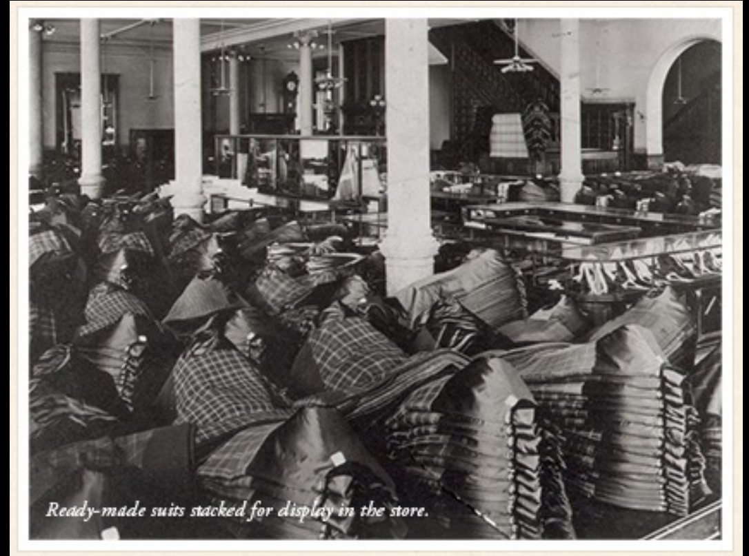
Ready-to-wear suits being displayed