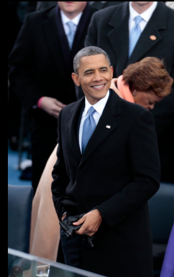
Former President Barack Obama wearing Brooks Brothers