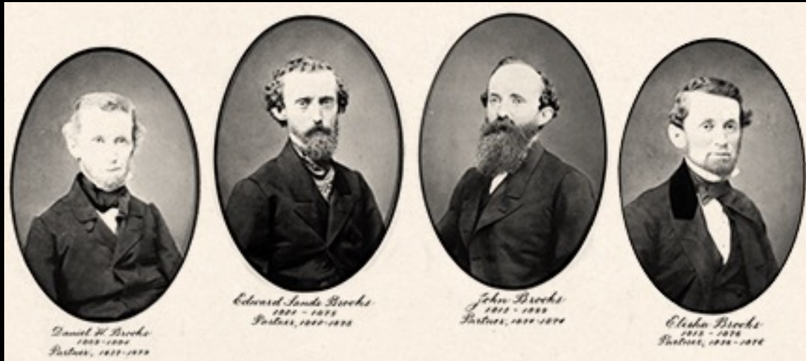
The four Brook Brothers