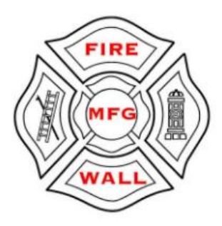
Why Our Jackets Are The Best