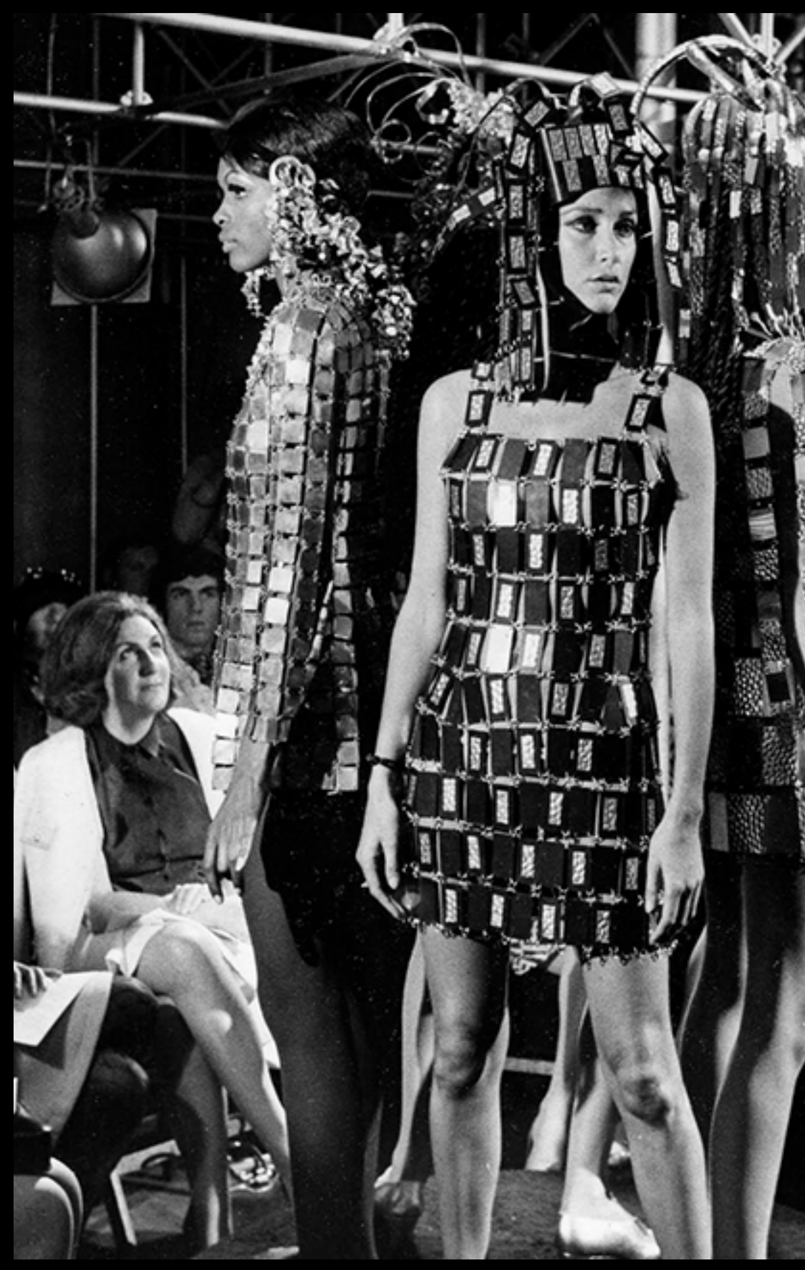
Figure 2. Paco Rabanne Haute Couture