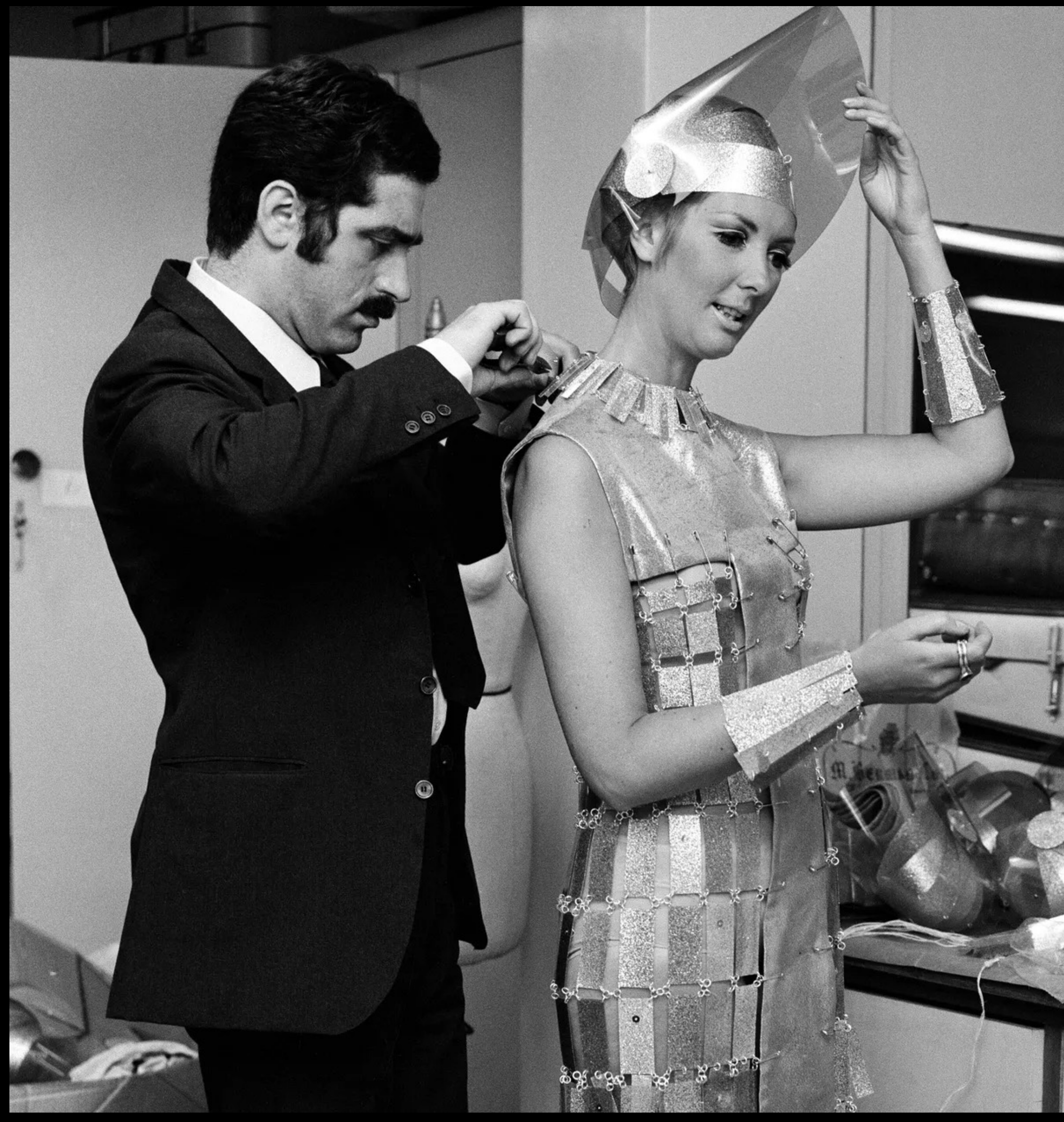
Figure 3. Paco Designing.

Message to Paco Rabanne's marketing director: The future is now. Paco, Courreges and Cardin invented fashion futurism. Show us where it all came from. The space age is back.