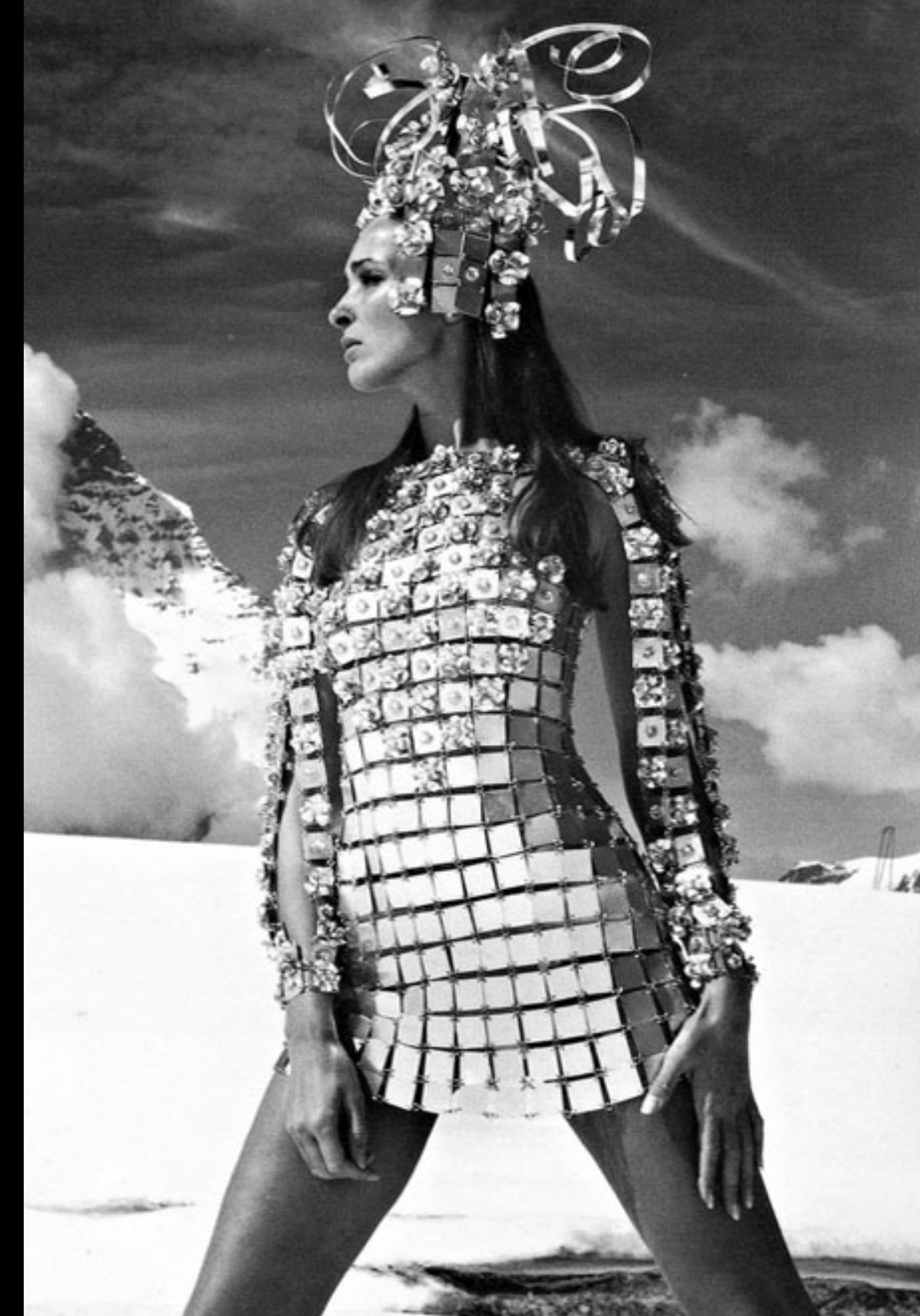
Figure 4. The famous chainmail dress.