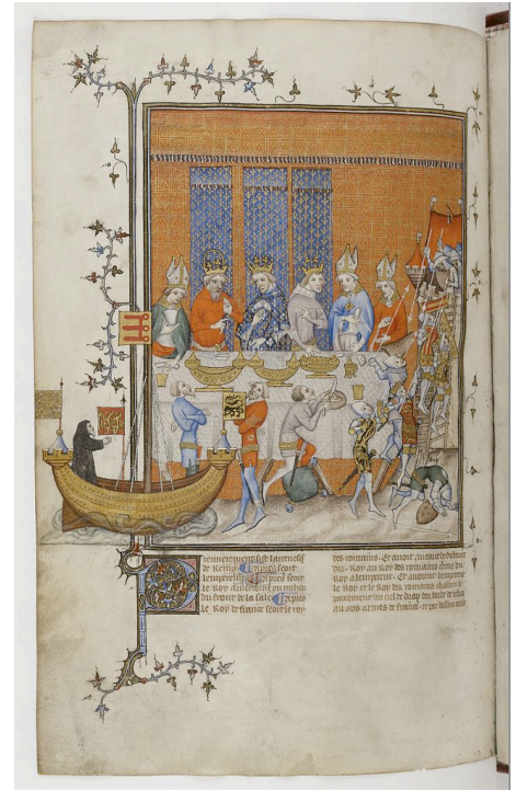
Chronique de Charles V , MS. Français, 2813, f.473 v . Bibliothèque Nationale.

Research Question: Based on the premise and visual information in the manuscript illumination, what can we conclude about theatre and performance at the court? What conclusions are we unable to make, based on the available evidence? Where else might we look to fill in the gaps of our understanding? Considering these questions, free write for approximately 7-10 minutes. Don't edit yourself. At this stage of a research project there are no "bad" ideas.