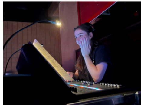
Mixing the show on 04/19