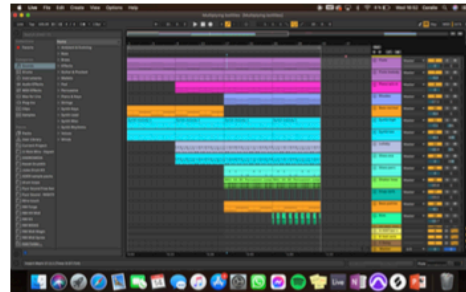
Ableton timeline for the song "Multiplying bottles", repurposed as the "9x11 whiteboard" song