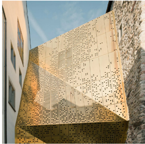
8. Janus, Rapperswil-Jona Municipal Museum by mlzd