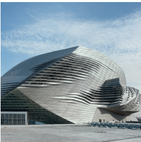
5. Dalian International Conference Center by Coop Himmelb(l)au