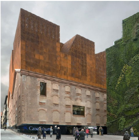
3. de Young Museum by Herzog & de Meuron