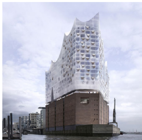
6. Elbphilharmonie by Herzog & de Meuron