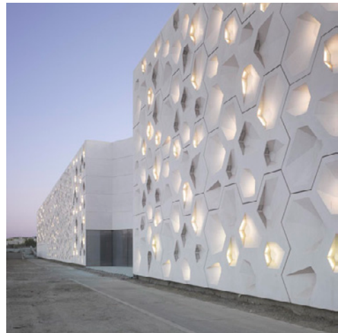
4. Contemporary Art Centre Cordoba by Nieto Sobejano Arquitectos