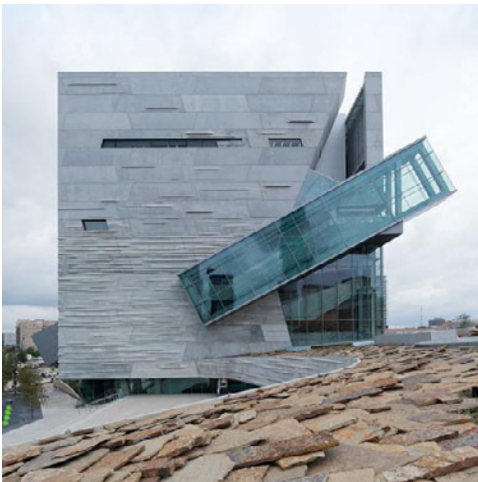
15. Perot Museum of Nature and Science by Morphosis