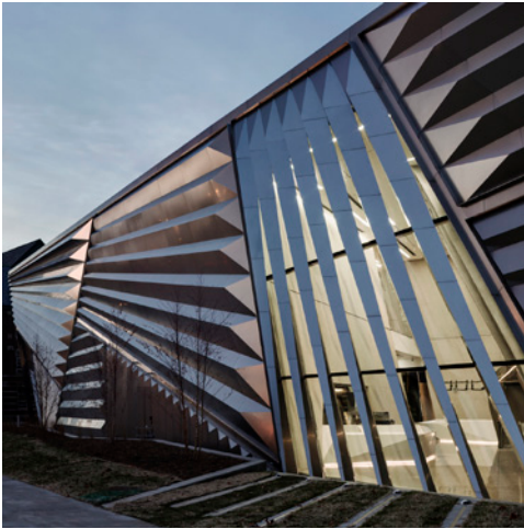
1. Broad Art Museum, Lansing by Zaha Hadid