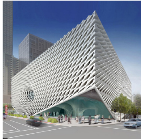
2. Broad Art Museum, Los Angeles by Diller Scodidio + Renfro