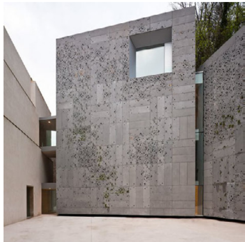
16. San Telmo Museum by Nieto Sobejano Arquitectos