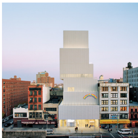
12. New Museum of Contemporary Art by SAANA