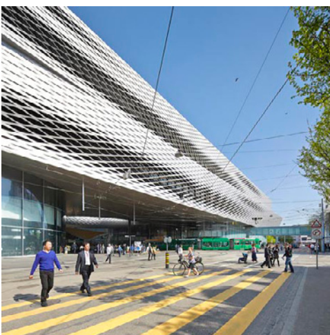
11. Messe Basel Exhibition Hall by Herzog & de Meuron