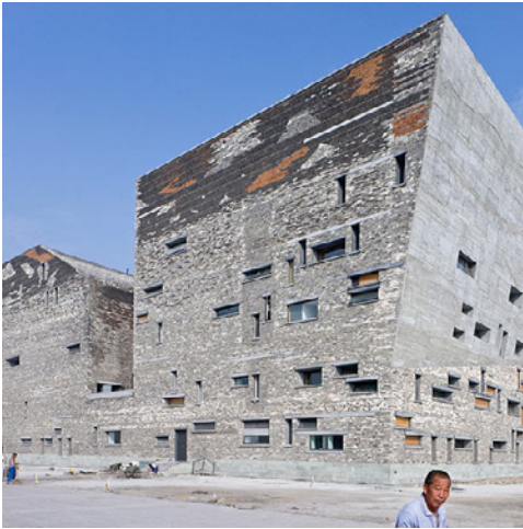
13. Ningbo Historic Museum by Wang Shu