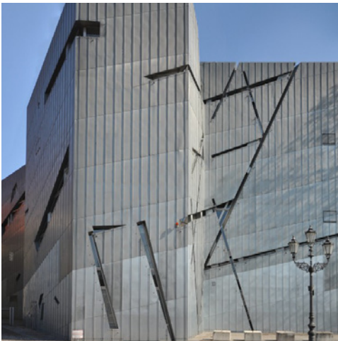
9. Jewish Museum, Berlin by Daniel Libeskind