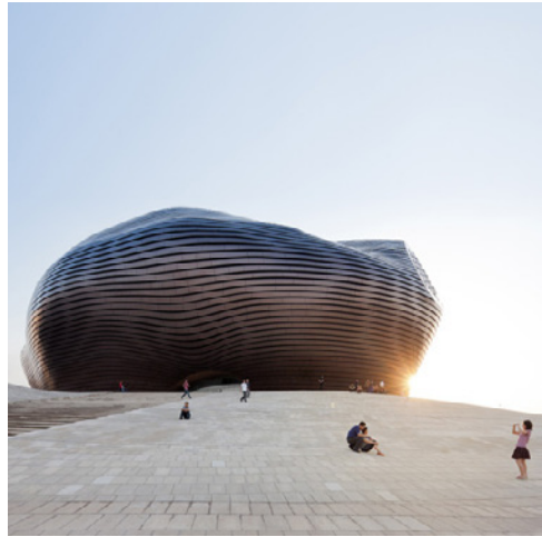
14. Ordos Museum by MAD Architects