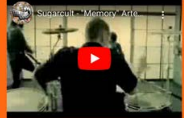
Sugarcult - "Memory"