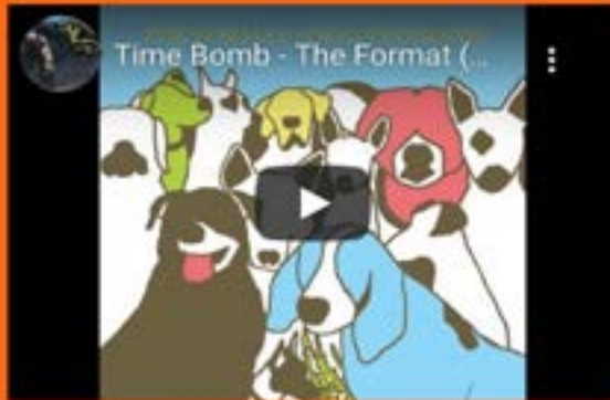
The Format - "Time Bomb"