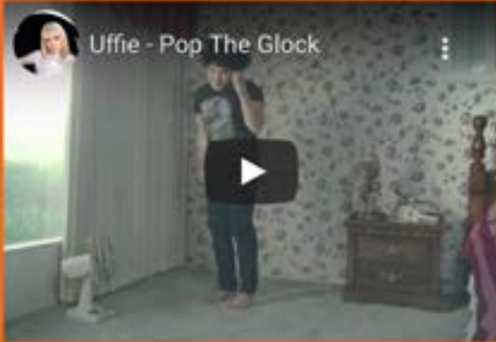
Uffie - "Pop The Glock"