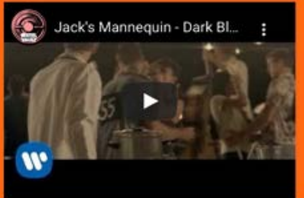
Jack's Mannequin - "Dark Blue"