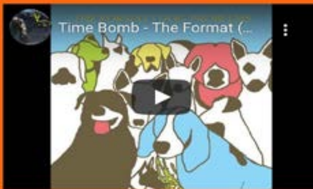
The Format - "Time Bomb"