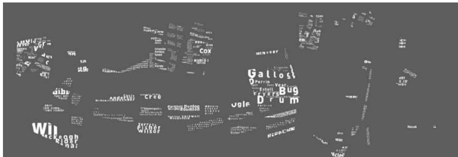
PETER ANDERSON Moving Surnames, Northern Ireland series 2, Treble page spread, IT Magazine.

As we can see, the production workflow specific to the software age has two major consequences: the hybridity of media language we see today across the contemporary design universe, and the use of the similar techniques and strategies regardless of the output media and type of project. Like an object built from Lego blocks, a typical design today combines techniques coming