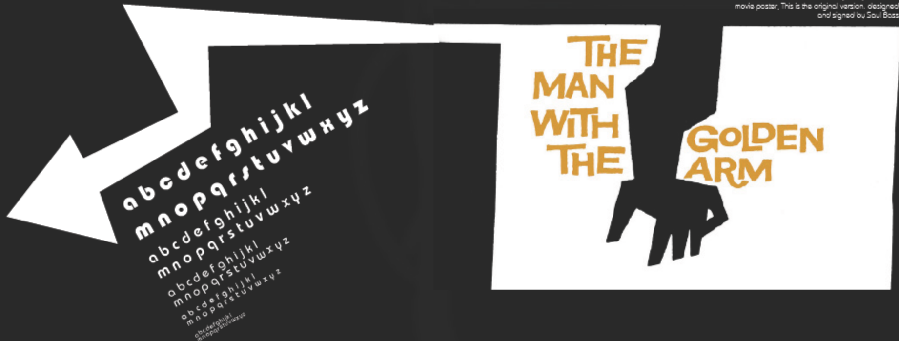
THE MAN WITH THE GOLDEN ARM (1955) one sheet movie poster. This is the original version, designed and signed by Saul Bass