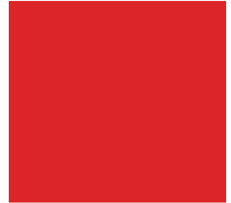
Red, adding Cyan