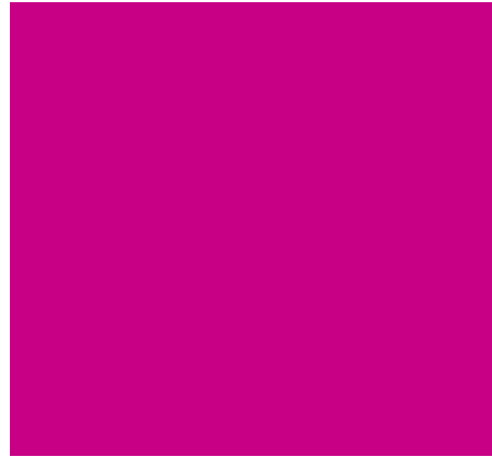
80 % Magenta, 20 % Blue