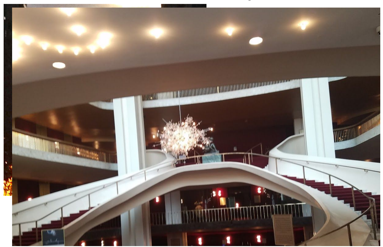
This image shows how beautiful the stairs

are and how important they are to making the guests feel welcome the space forces elegance on the viewer or guest without being intimidating instead it welcomes the viewer to get closer and go in i was actually quite disappointed we weren't allowed to go in