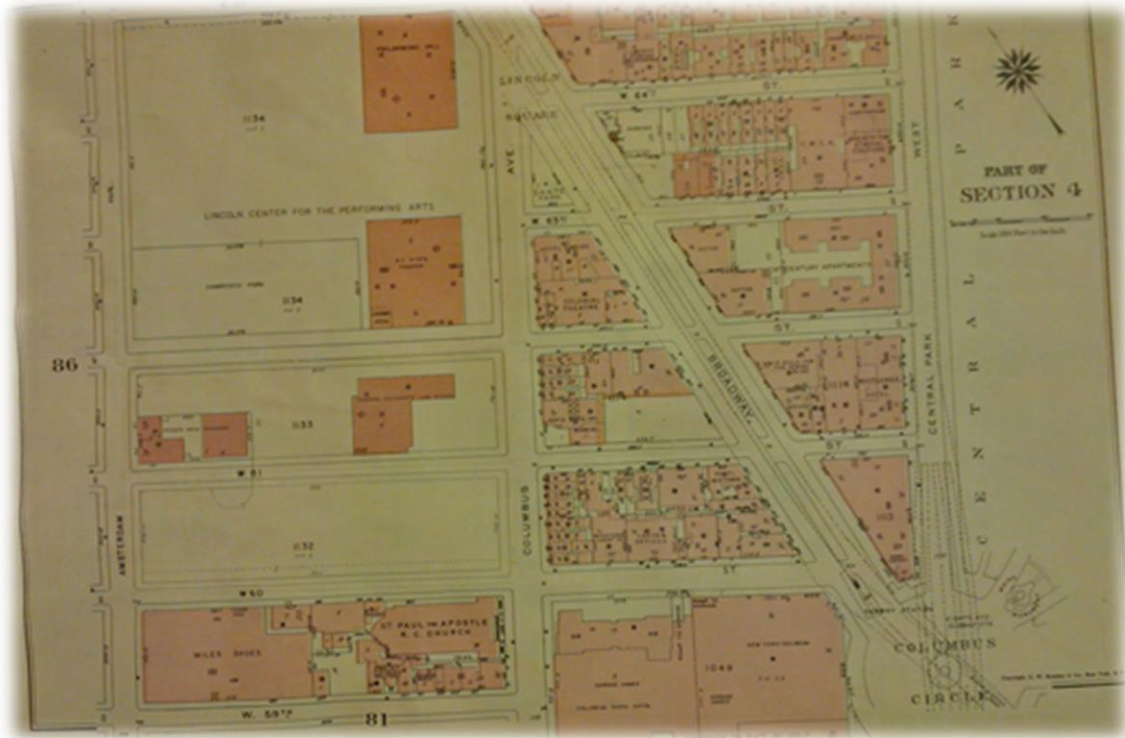
Plate 87, 1964: New York Historical Society version of now Lincoln Square Here we can clearly see Lincoln Center utilizing three city blocks, and the remaining two block has been dramatically cleared out.