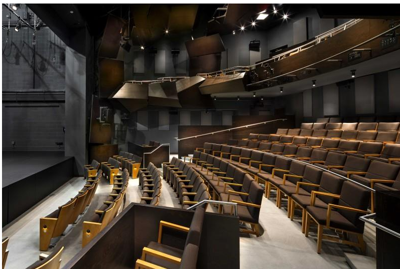
Image depicting the theater room itself.

The space is designed to be able to hold a lot of people, in which come some of its flaws. The balconies above, were designed very poorly in terms of space. Just about every person, including myself had to sit with their legs slanted over to the side as to fit in between the narrow space of their seat, and