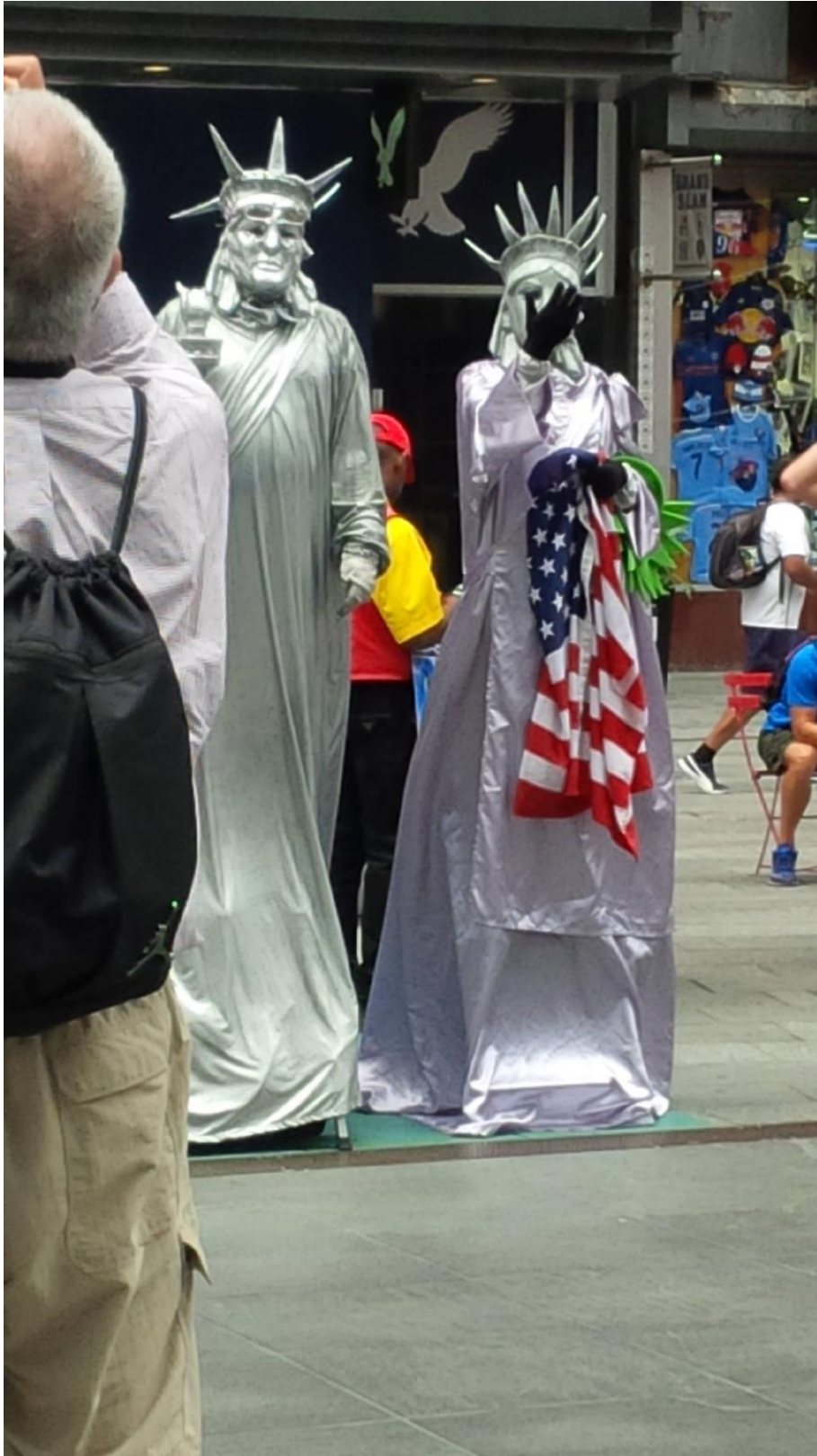
This image shows the Lady Liberty Performers in the Designated Activity Zone.