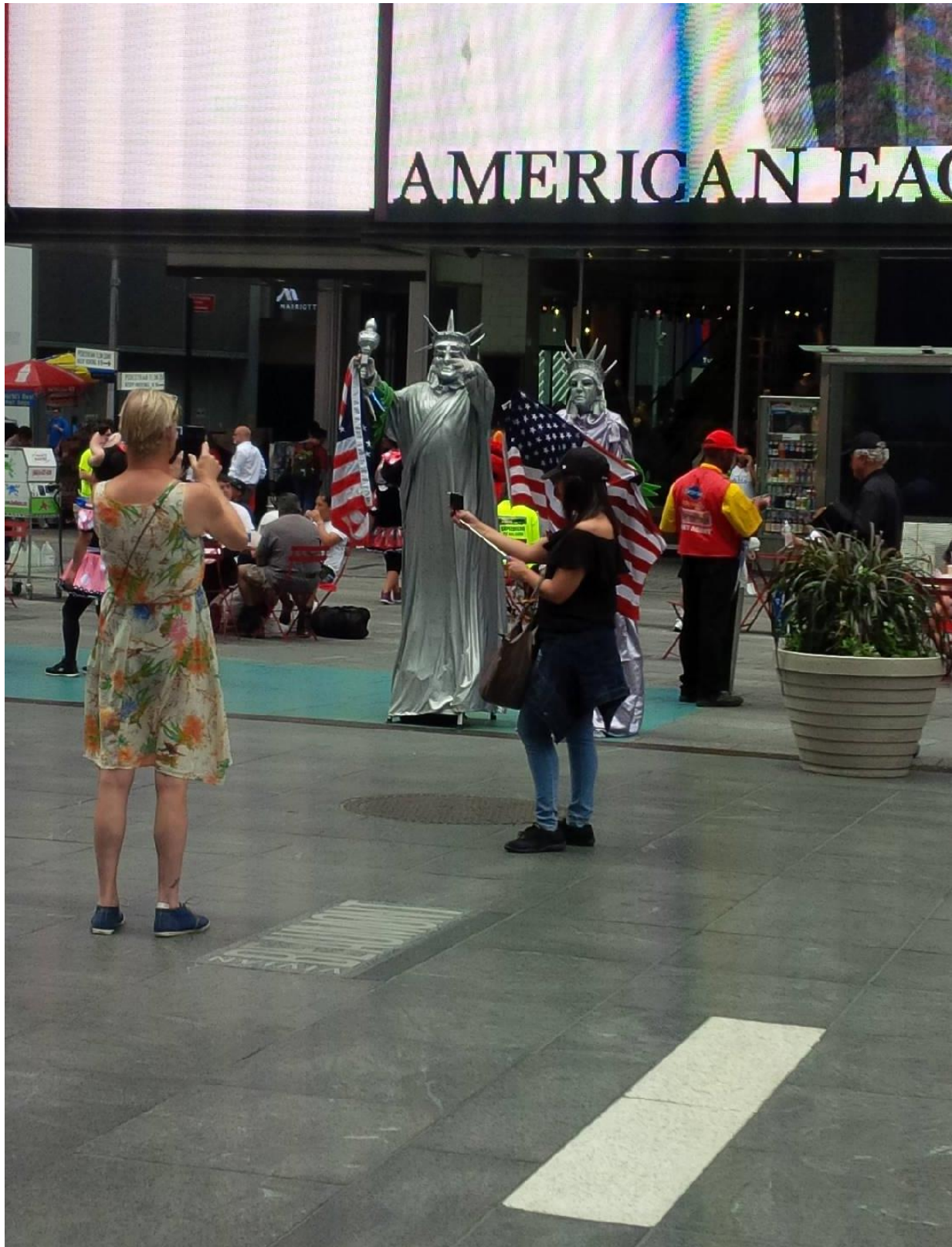
This image shows the Lady Liberty Performers inviting pedestrians over to take pictures.