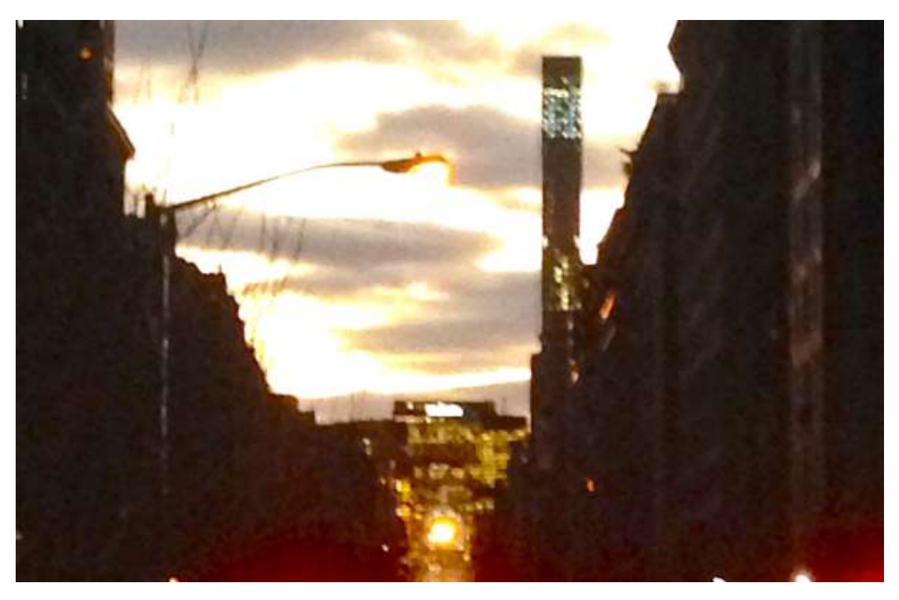
Write description of sketch or photo here, explaining why it is important and what it shows