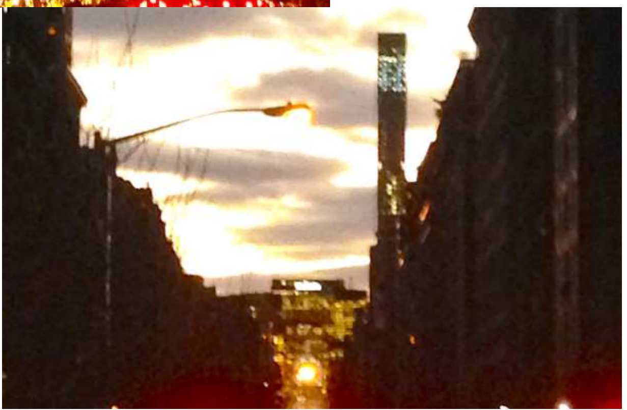
explaining why it is important and what it shows

Write description of sketch or photo here,