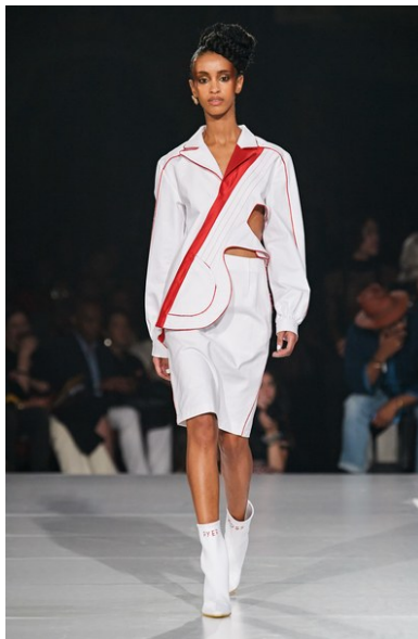
Jazzed look on White