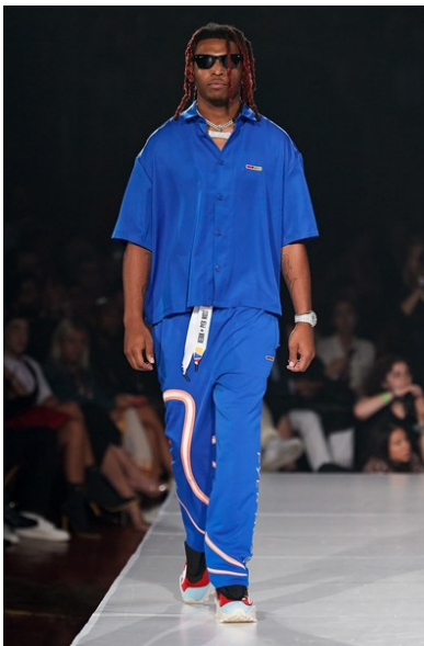
Royal Blue Triumph