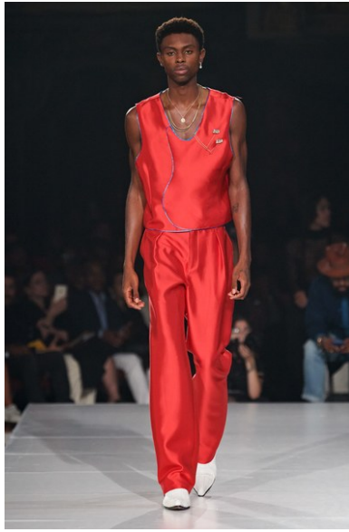
Red Hues and Guitar Blues