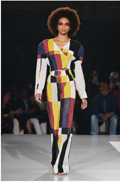
Black Girl Magic on Color Blocking