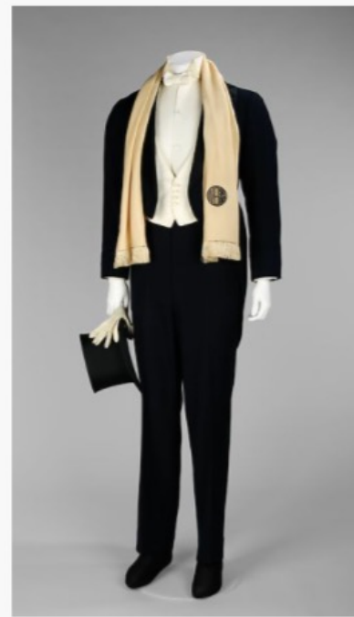
Brooks Brothers: Evening suit: 1933: Wool, Silk, Cotton, and Leather: 2009.300.925a–m