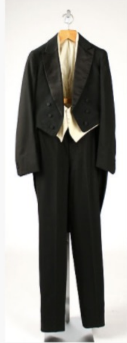
Brooks Brothers: Evening suit: 1920: Wool, Silk, and Cotton: C.I.50.42.5a–c