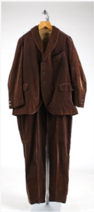
Brooks Brothers: Evening suit: 1912: Cotton and Silk 1978.477.24a–c