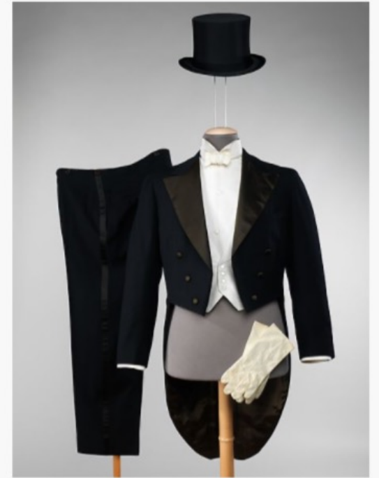
Brooks Brothers: Evening suit: 1947: Wool, Cotton, Leather, and Silk: 2009.300.1019a–m