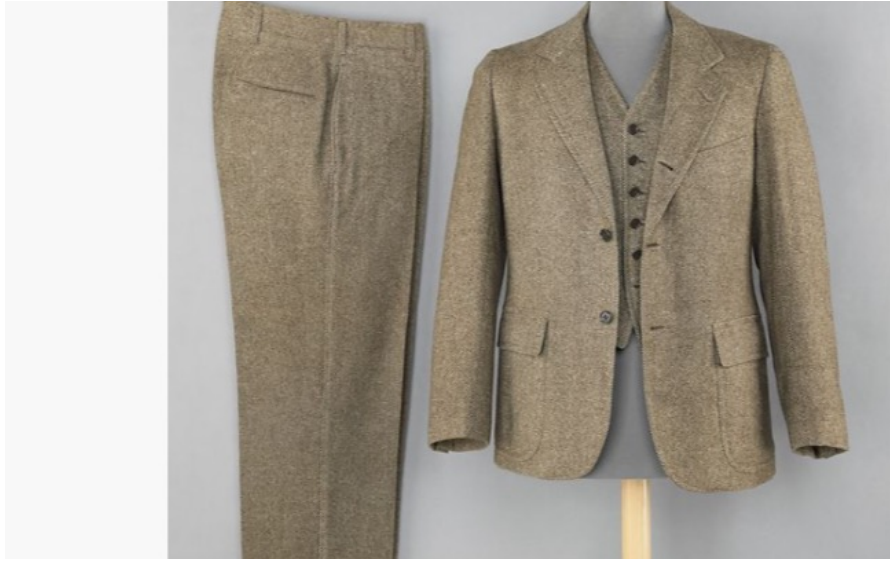
Brooks Brothers: Suit: 1955:Wool and Linen: 2009.300.875a-d