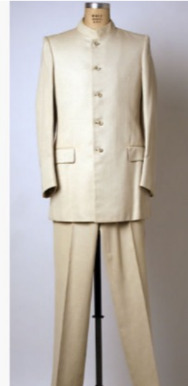
Pierre Cardin: Suit: 1971:Wool: 1997.425.2a, b