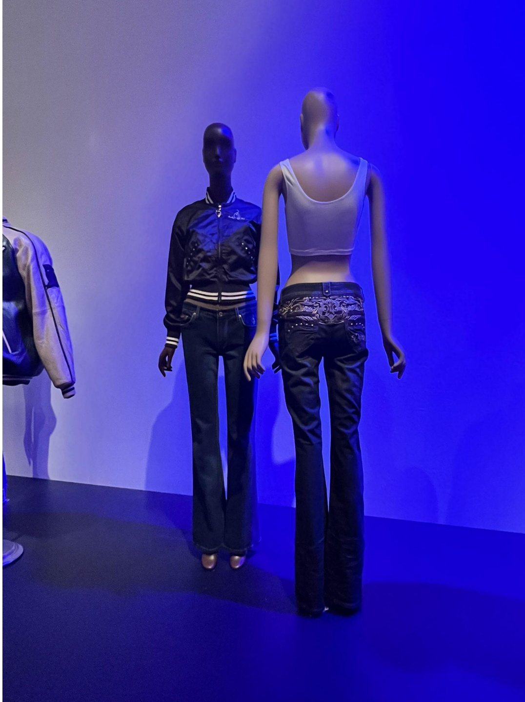
Baby Phat Back Satin Bomber Jacket and Jeans, 1998.