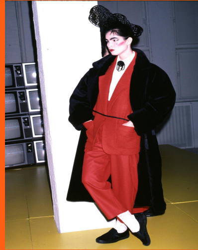
WilliWear Fall 1985