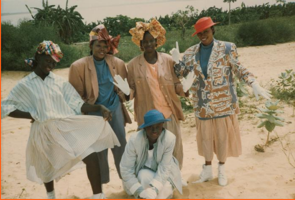
Willi Smith for WilliWear, Spring 1986 Collection