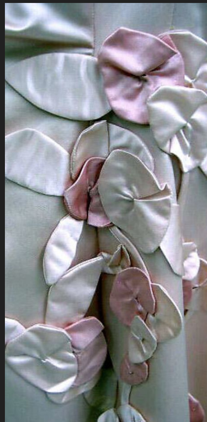
Medium: nylon, silk