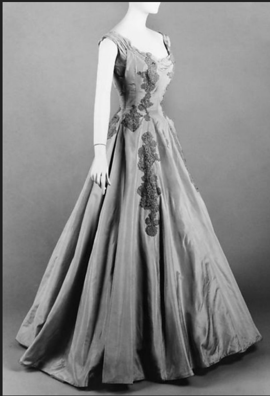
Evening Dress, 1956