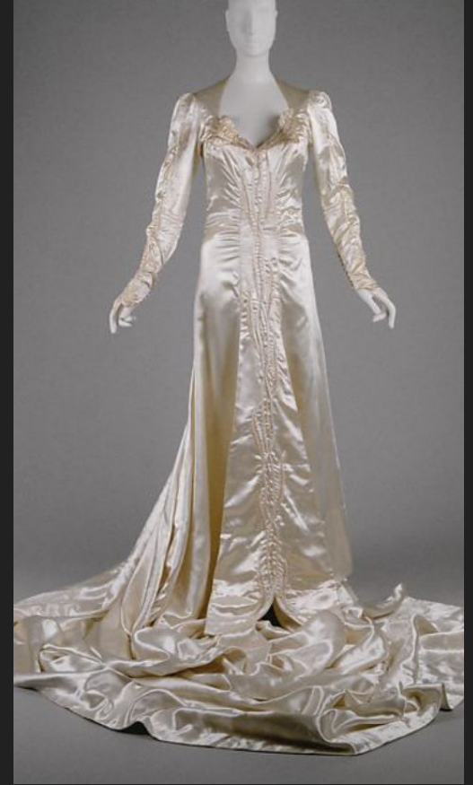
Ann Lowe Wedding Dress, 1941 Accession Number: 1975.349a, b