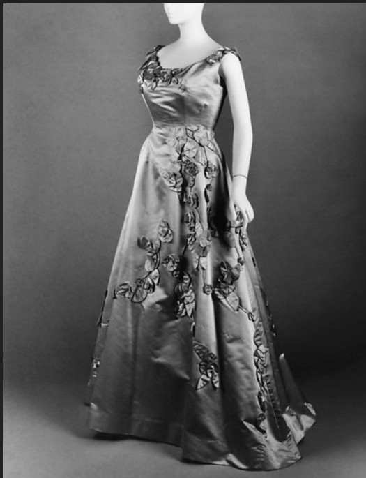
Evening dress, 1962