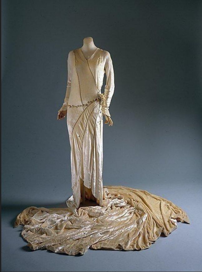
Madeleine Vionnet, Example of a dress cut 'across the bias', silk, 1929.