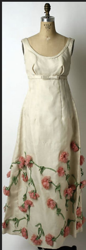
Evening dress, 1968