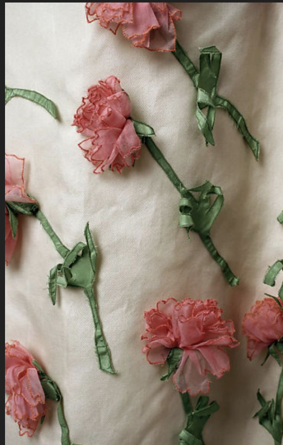
Medium: cotton, silk