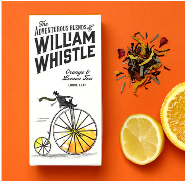
Exposure: Hierarchy in Package Design