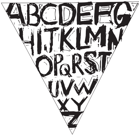
Image Trace is not the best option for this