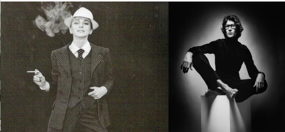
Le Smoking Suit