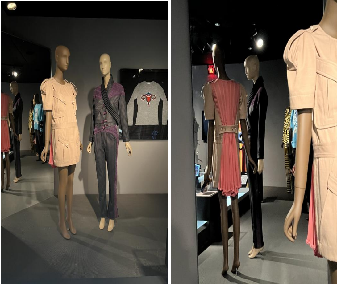
Photo 1 & 2 FITNYC (2023, July) ¡Moda Hoy! Latin American and Latinx Fashion