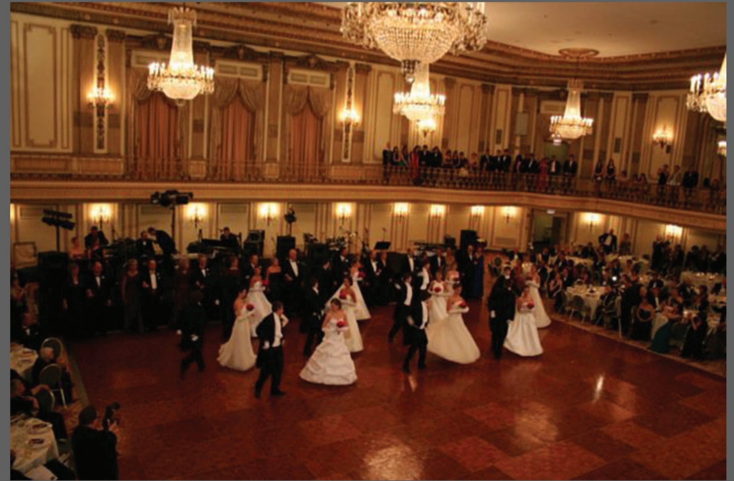
THE LAST DANCE