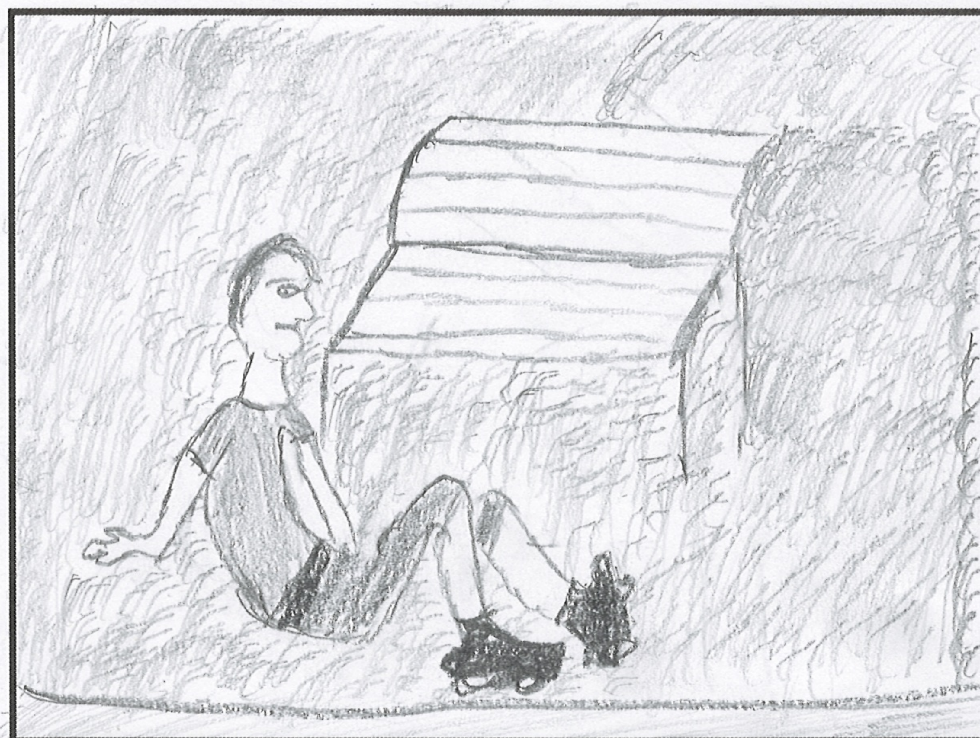
Scene: 6 Panel: 2

Tracking the Roller- Blader in to the bench