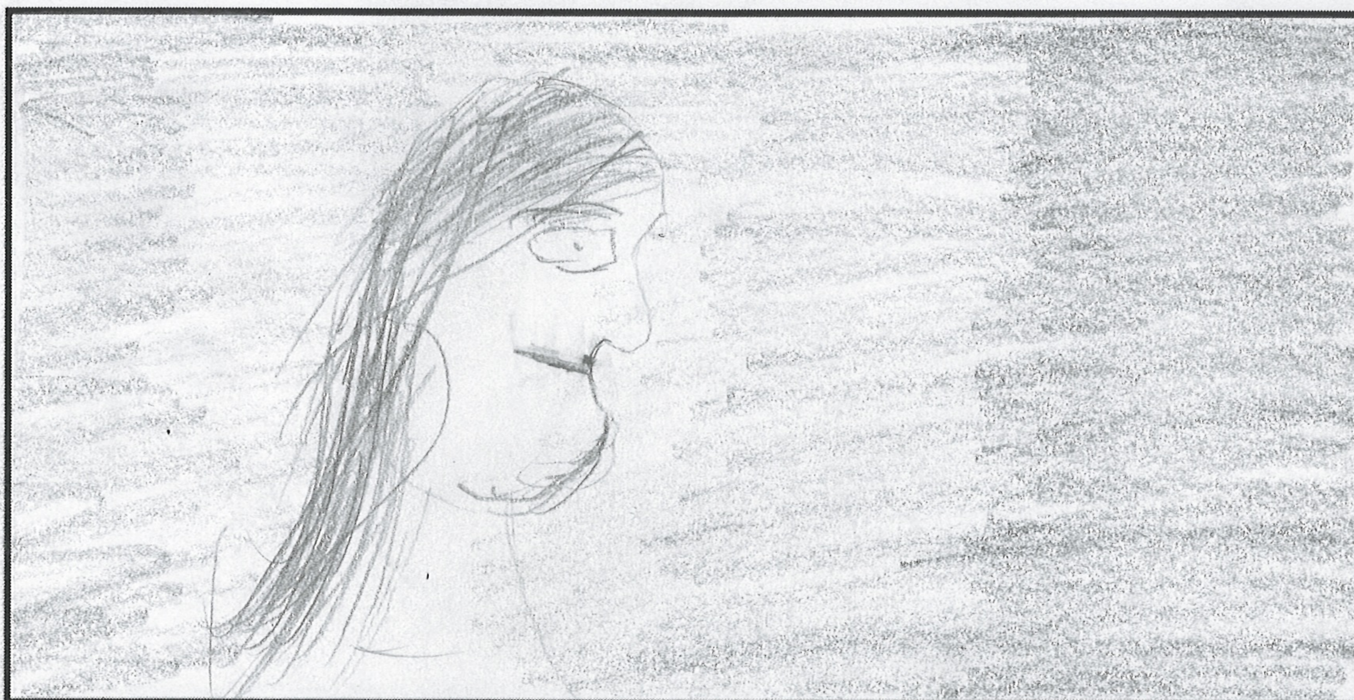
Scene: 5 Panel: 2

Insert / shot close up shot of woman's heel of shoe breaking