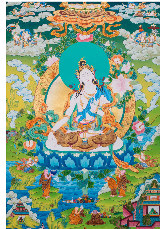
Bodhisattva Green/White Tara: