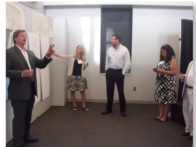
↑ Charrette presentations, part of three regional workshops