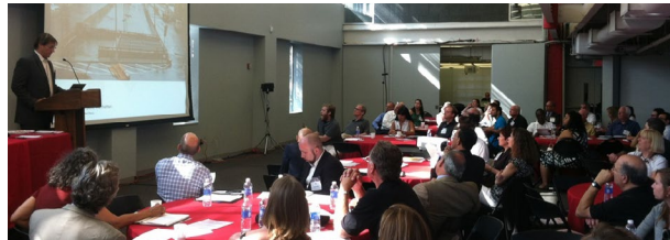
↑ Workshop 1 - NJIT, Newark, NJ