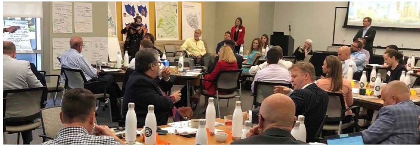
↑ Houston Resilient Futures workshop with community stakeholders in working groups, launching several ideas and teams