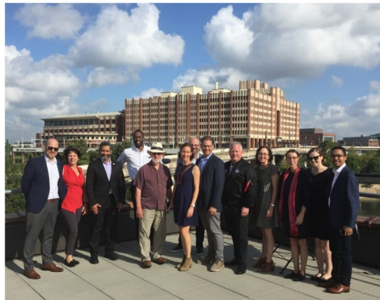
Houston 2020 Visions Jury and AIA Houston Steering Committee.